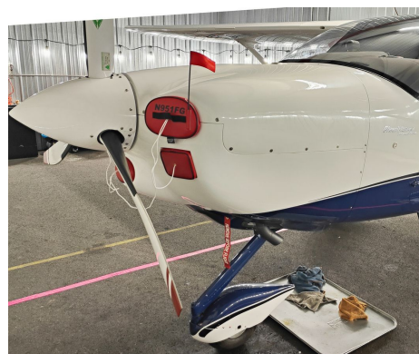
Tecnam P2010 Engine Inlet Plugs