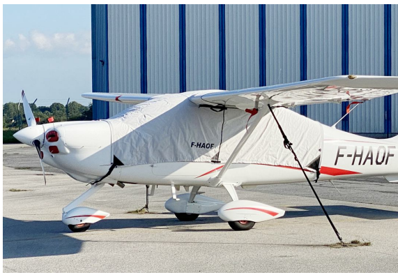
Tecnam P2010 Over-Top Canopy Cover, Engine Plugs