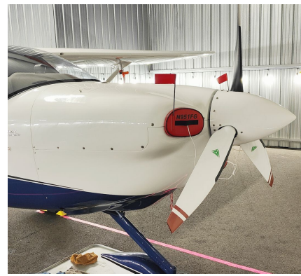
Tecnam P2010 Engine Inlet Plugs