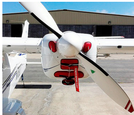
Tecnam P2006T Engine Plugs

Engine Inlet Plugs are custom fit for your Tecnam P2006T Twin intakes, made with heavy-duty vinyl material, and stuffed with a single block of sculpted urethane foam. Each plug has a zipper that allows the foam to be removed and dried if necessary. Engine plugs have warning flags that are visible from the cockpit or 'remove before flight' streamers sewn onto the face of the plugs. Most plugs are imprinted with the aircraft registration number in black for an extra charge. Storage bag NOT included. Engine plugs may be inserted after flight when the engine is still warm. Engine Inlet Plugs are commonly referred to as Cowl Plugs, Intake Plugs, Cowl Blocks, Engine Blocks, and Engine Bunges.