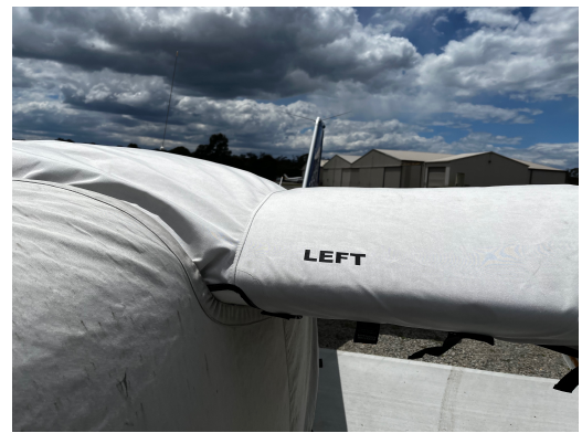
Tecnam P2006T Twin Wing & Engine Covers, All Year Use