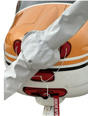
Tecnam P2002 Sierra Engine Plug Set