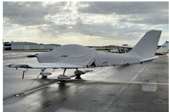
Tecnam P2002 Sierra Complete Cover Set