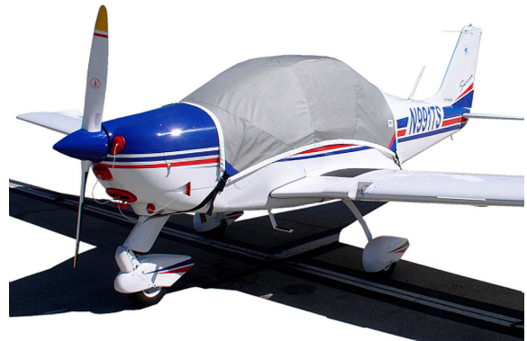
Tecnam Sierra Canopy Cover & Engine Plugs