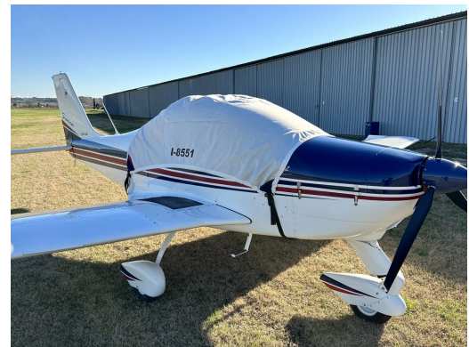
Tecnam P2002 Sierra Canopy Cover