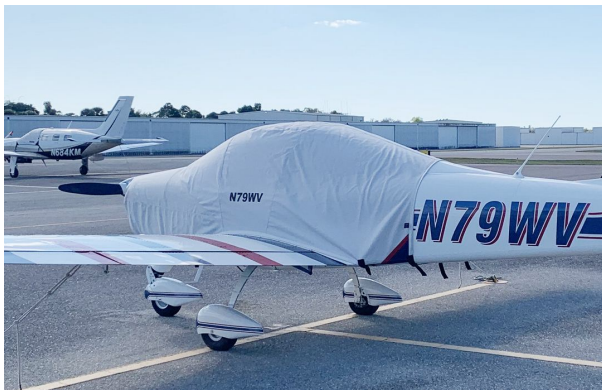
Tecnam Sierra Extended Canopy/Engine Cover

This cover type is made from Silver Acrylic Sunbrella canvas and is 100% lined with a soft and smooth microfiber. Bruce's Custom Covers developed this material combination especially for aircraft protection. The outer material is medium weight and treated for water resistance, UV resistance and anti-static buildup. The inner lining is a very soft and smooth microfiber to prevent scratching. The material is very reflective, and tests show that the cabin interior temperature can be reduced to near-ambient temperature on the hottest of days. It is water, ice and snow repellent, yet breathable to allow moisture to escape from between the cover and the aircraft surface.