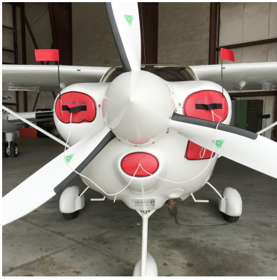
Tecnam P2010 Engine Plugs