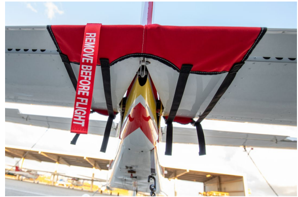
Tecnam Bravo Tailcone Cover