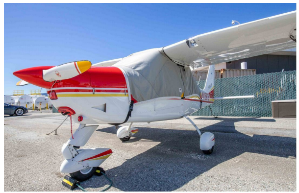
Tecnam P2004 Bravo