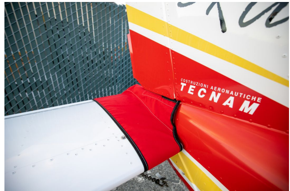
Tecnam Bravo Tailcone Cover