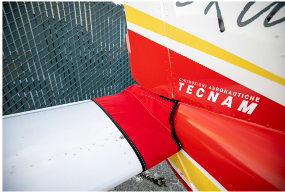
Tecnam Bravo Tailcone Cover

WINTER USE MATERIAL - Made with Solution-Dyed Polyester fabric, this option is intended for seasonal use to aid in deicing, rain mitigation, or for occasional travel. The material is lighter and more compact, but more susceptible to UV damage and may have a shorter useful life if used continuously outside than the all-year use material.