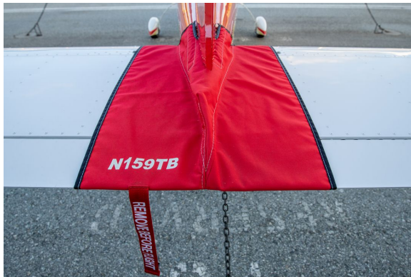
Tecnam Bravo Tailcone Cover

WINTER USE MATERIAL - Made with Solution-Dyed Polyester fabric, this option is intended for seasonal use to aid in deicing, rain mitigation, or for occasional travel. The material is lighter and more compact, but more susceptible to UV damage and may have a shorter useful life if used continuously outside than the all-year use material.