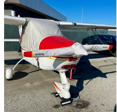
FOR INTERIOR USE. Cub Crafters CC-11 Insulated Hangar Blanket, available in Tecnam Bravo Canopy & Prop Covers, Engine Red or Silver Plugs