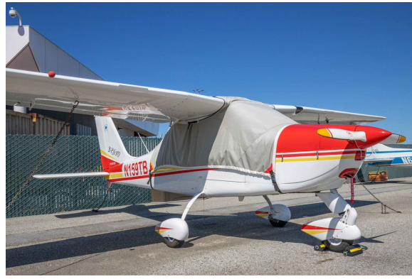
Tecnam P2004 Bravo