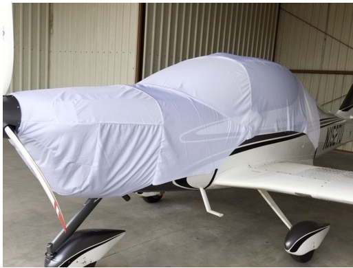
Tecnam Astore Canopy/Engine Cover, test fit cover

This cover type is made from Silver Acrylic Sunbrella canvas and is 100% lined with a soft and smooth microfiber. Bruce's Custom Covers developed this material combination especially for aircraft protection. The outer material is medium weight and treated for water resistance, UV resistance and anti-static buildup. The inner lining is a very soft and smooth microfiber to prevent scratching. The material is very reflective, and tests show that the cabin interior temperature can be reduced to near-ambient temperature on the hottest of days. It is water, ice and snow repellent, yet breathable to allow moisture to escape from between the cover and the aircraft surface.