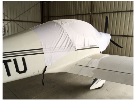
Tecnam Astore Canopy/Engine Cover, test fit cover