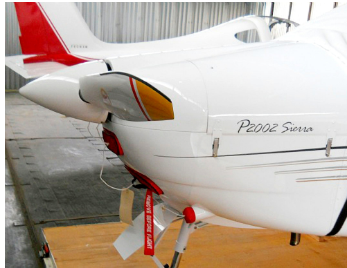
Tecnam Sierra Engine Inlet Plugs set

Engine Inlet Plugs are custom fit for your Tecnam Astore intakes, made with heavy-duty vinyl material, and stuffed with a single block of sculpted urethane foam. Each plug has a zipper that allows the foam to be removed and dried if necessary. Engine plugs have warning flags that are visible from the cockpit or 'remove before flight' streamers sewn onto the face of the plugs. Most plugs are imprinted with the aircraft registration number in black for an extra charge. Storage bag NOT included. Engine plugs may be inserted after flight when the engine is still warm. Engine Inlet Plugs are commonly referred to as Cowl Plugs, Intake Plugs, Cowl Blocks, Engine Blocks, and Engine Bungs.