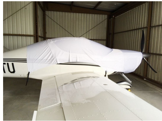
Tecnam Astore Canopy/Engine Cover, test fit cover