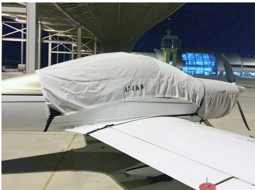
Tecnam Astore Canopy & Engine Covers

This cover type is made from Silver Acrylic Sunbrella canvas and is 100% lined with a soft and smooth microfiber. Bruce's Custom Covers developed this material combination especially for aircraft protection. The outer material is medium weight and treated for water resistance, UV resistance and anti-static buildup. The inner lining is a very soft and smooth microfiber to prevent scratching. The material is very reflective, and tests show that the cabin interior temperature can be reduced to near-ambient temperature on the hottest of days. It is water, ice and snow repellent, yet breathable to allow moisture to escape from between the cover and the aircraft surface.