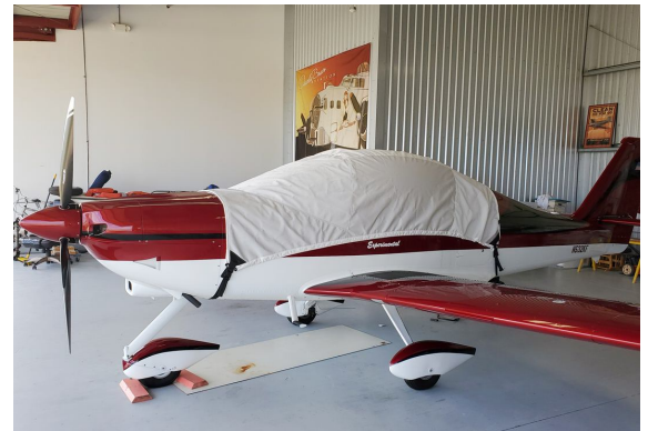
Tecnam Astore Canopy Cover