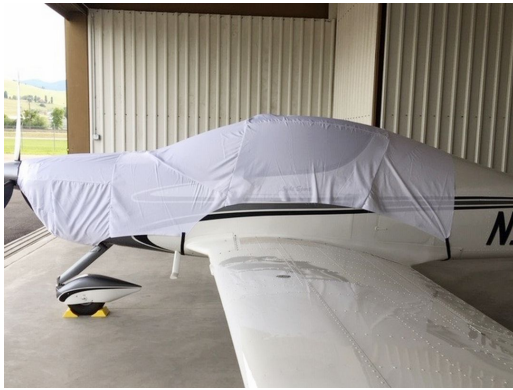
Tecnam Astore Canopy/Engine Cover, test fit cover

Travel Covers are made with Silver Solution-Dyed Polyester fabric and only lined over the windshield to save weight. The material is lightweight and more compact for easy stowage in the aircraft. The polyester material is water resistant, but only intended for occasional use outside. We also have an ultra lightweight material available for fitted hangar dust covers. For daily outdoor use, the non-travel Sunbrella Cover is the best choice.