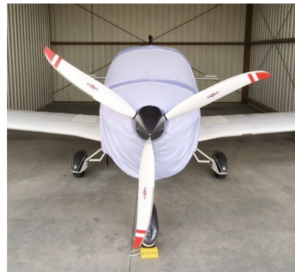
Tecnam Astore Canopy/Engine Cover, test fit cover