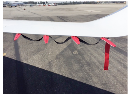
Example photo from a Biz Jet