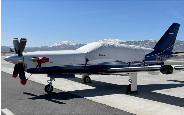
Socata TBM Canopy Cover