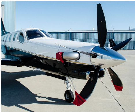
TBM 900 Prop Tie/Exhaust Covers

This cover type is made from Silver Acrylic Sunbrella canvas and is 100% lined with a soft and smooth microfiber. Bruce's Custom Covers developed this material combination especially for aircraft protection. The outer material is medium weight and treated for water resistance, UV resistance and anti-static buildup. The inner lining is a very soft and smooth microfiber to prevent scratching. The material is very reflective, and tests show that the cabin interior temperature can be reduced to near-ambient temperature on the hottest of days. It is water, ice and snow repellent, yet breathable to allow moisture to escape from between the cover and the aircraft surface.