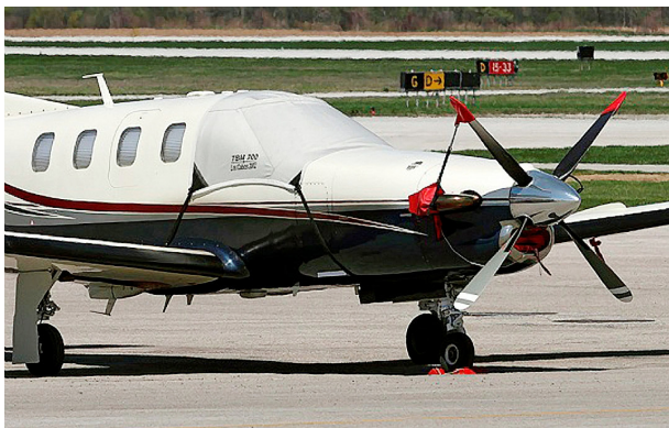
TBM 700 Cockpit Cover, Prop Tie-down/Exhaust Covers, Engine Inlet Plugs & Pitot Cover

Engine Inlet Plugs are custom fit for your Socata TBM 700, 750, 850, 900, 910, 930, 940, 960 intakes, made with heavy-duty vinyl material, and stuffed with a single block of sculpted urethane foam. Each plug has a zipper that allows the foam to be removed and dried if necessary. Engine plugs have warning flags that are visible from the cockpit or 'remove before flight' streamers sewn onto the face of the plugs. Most plugs are imprinted with the aircraft registration number in black for an extra charge. Storage bag NOT included. Engine plugs may be inserted after flight when the engine is still warm. Engine Inlet Plugs are commonly referred to as Cowl Plugs, Intake Plugs, Cowl Blocks, Engine Blocks, and Engine Bung s. Designed to prevent damage to the aircraft extremities in crowded hangars, these products are made of bright red Naugahyde and thickly padded with a sandwich of closed cell foam.