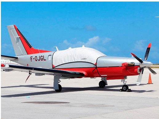
TBM Canopy Cover, Prop Tie/Exhaust Covers

Travel Covers are made with Silver Solution-Dyed Polyester fabric and only lined over the windshield to save weight. The material is lightweight and more compact for easy stowage in the aircraft. The polyester material is water resistant, but only intended for occasional use outside. We also have an ultra lightweight material available for fitted hangar dust covers. For daily outdoor use, the non-travel Sunbrella Cover is the best choice.