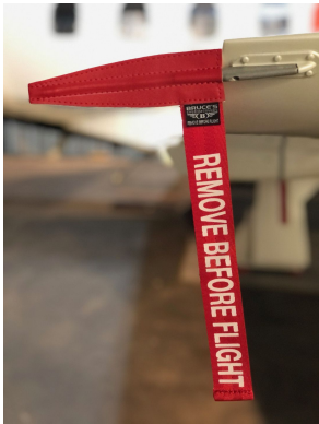
TBM-900 Static Wick Protector