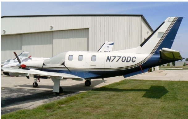
Socata TBM 700 Cockpit Cover, Prop Tie/Exhaust Cover Set

Travel Covers are made with Silver Solution-Dyed Polyester fabric and only lined over the windshield to save weight. The material is lightweight and more compact for easy stowage in the aircraft. The polyester material is water resistant, but only intended for occasional use outside. We also have an ultra lightweight material available for fitted hangar dust covers. For daily outdoor use, the non-travel Sunbrella Cover is the best choice.