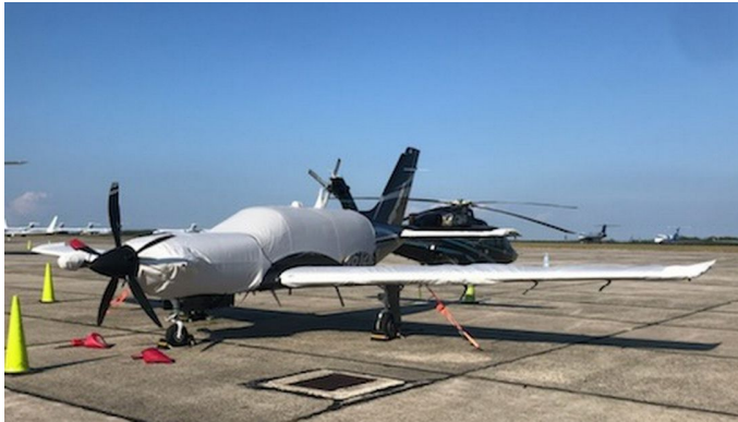
Socata TBM Canopy, Engine, Wing & Horizontal Stabilizer Covers

WINTER USE MATERIAL - Made with Solution-Dyed Polyester fabric, this option is intended for seasonal use to aid in deicing, rain mitigation, or for occasional travel. The material is lighter and more compact, but more susceptible to UV damage and may have a shorter useful life if used continuously outside than the all-year use material.