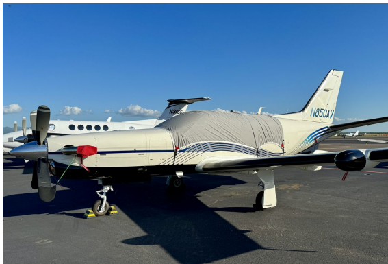
Socata TBM 850 Travel Weight Canopy Cover, Prop Tie/Exhaust Covers

Travel Covers are made with Silver Solution-Dyed Polyester fabric and only lined over the windshield to save weight. The material is lightweight and more compact for easy stowage in the aircraft. The polyester material is water resistant, but only intended for occasional use outside. We also have an ultra lightweight material available for fitted hangar dust covers. For daily outdoor use, the non-travel Sunbrella Cover is the best choice.