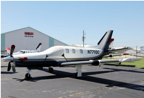
Socata TBM 700 Cockpit Cover, Prop Tie/Exhaust Cover Set

This cover type is made from Silver Acrylic Sunbrella canvas and is 100% lined with a soft and smooth microfiber. Bruce's Custom Covers developed this material combination especially for aircraft protection. The outer material is medium weight and treated for water resistance, UV resistance and anti-static buildup. The inner lining is a very soft and smooth microfiber to prevent scratching. The material is very reflective, and tests show that the cabin interior temperature can be reduced to near-ambient temperature on the hottest of days. It is water, ice and snow repellent, yet breathable to allow moisture to escape from between the cover and the aircraft surface.