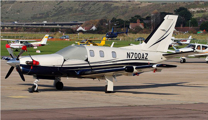
TBM 700 Cockpit Cover, Prop Tie-down/Exhaust Covers, & Engine Inlet Plugs

Engine Inlet Plugs are custom fit for your Socata TBM 700, 750, 850, 900, 910, 930, 940, 960 intakes, made with heavy-duty vinyl material, and stuffed with a single block of sculpted urethane foam. Each plug has a zipper that allows the foam to be removed and dried if necessary. Engine plugs have warning flags that are visible from the cockpit or 'remove before flight' streamers sewn onto the face of the plugs. Most plugs are imprinted with the aircraft registration number in black for an extra charge. Storage bag NOT included. Engine plugs may be inserted after flight when the engine is still warm. Engine Inlet Plugs are commonly referred to as Cowl Plugs, Intake Plugs, Cowl Blocks, Engine Blocks, and Engine Bung s. Designed to prevent damage to the aircraft extremities in crowded hangars, these products are made of bright red Naugahyde and thickly padded with a sandwich of closed cell foam.