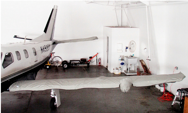
Socata TBM 700, 850 Wing and Horizontal Stabilizer Covers

WINTER USE MATERIAL - Made with Solution-Dyed Polyester fabric, this option is intended for seasonal use to aid in deicing, rain mitigation, or for occasional travel. The material is lighter and more compact, but more susceptible to UV damage and may have a shorter useful life if used continuously outside than the all-year use material.