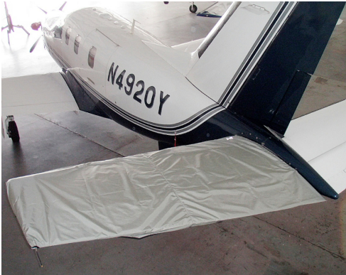
TBM 700, 850 Horizontal Stabilizer Covers