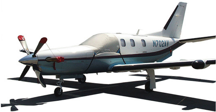
TBM 700 Cockpit Cover, Engine Plugs, Prop Tie/Exhaust Covers

Engine Inlet Plugs are custom fit for your Socata TBM 700, 750, 850, 900, 910, 930, 940, 960 intakes, made with heavy-duty vinyl material, and stuffed with a single block of sculpted urethane foam. Each plug has a zipper that allows the foam to be removed and dried if necessary. Engine plugs have warning flags that are visible from the cockpit or 'remove before flight' streamers sewn onto the face of the plugs. Most plugs are imprinted with the aircraft registration number in black for an extra charge. Storage bag NOT included. Engine plugs may be inserted after flight when the engine is still warm. Engine Inlet Plugs are commonly referred to as Cowl Plugs, Intake Plugs, Cowl Blocks, Engine Blocks, and Engine Bung s. Designed to prevent damage to the aircraft extremities in crowded hangars, these products are made of bright red Naugahyde and thickly padded with a sandwich of closed cell foam.