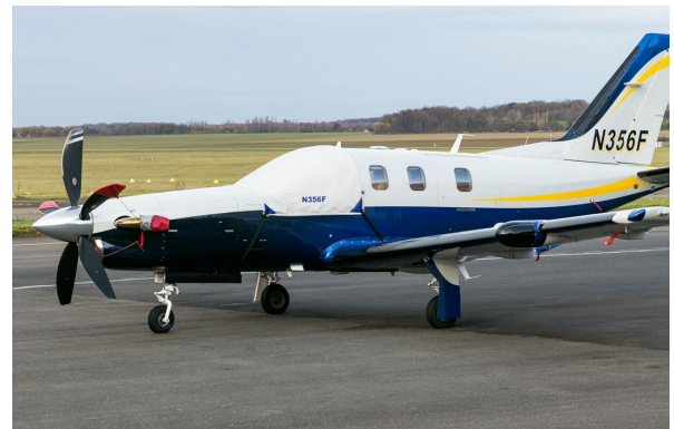
Socata TBM 700 Cockpit Cover (Not Bruce's Prop/Exhaust)