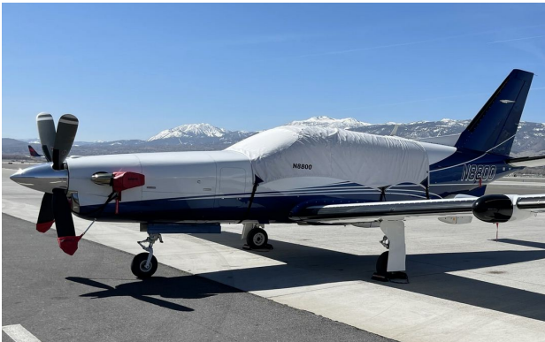
Socata TBM Canopy Cover