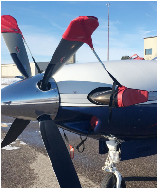
Piper PA46TP-500 Meridian Prop Tie/Exhaust Covers, Engine Plugs