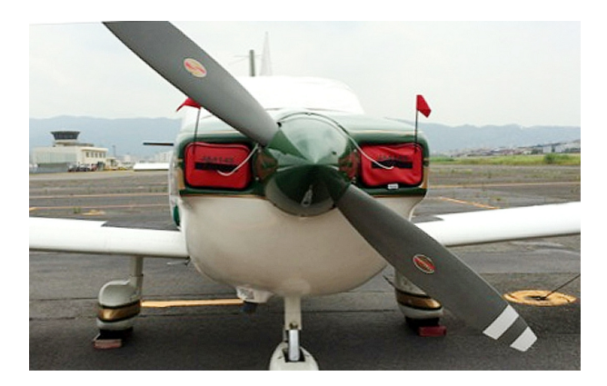
Socata TB-20 Engine Plugs