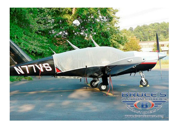
Socata TB20 Canopy Cover

Travel Covers are made with Silver Solution-Dyed Polyester fabric and only lined over the windshield to save weight. The material is lightweight and more compact for easy stowage in the aircraft. The polyester material is water resistant, but only intended for occasional use outside. We also have an ultra lightweight material available for fitted hangar dust covers. For daily outdoor use, the non-travel Sunbrella Cover is the best choice.