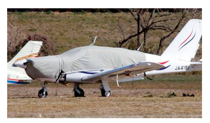
Canopy & Engine Covers