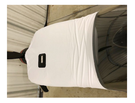
Socata Epsilon TB-30 Insulated Engine Cover, test fit cover

This cover type is made from Silver Acrylic Sunbrella canvas and is 100% lined with a soft and smooth microfiber. Bruce's Custom Covers developed this material combination especially for aircraft protection. The outer material is medium weight and treated for water resistance, UV resistance and anti-static buildup. The inner lining is a very soft and smooth microfiber to prevent scratching. The material is very reflective, and tests show that the cabin interior temperature can be reduced to near-ambient temperature on the hottest of days. It is water, ice and snow repellent, yet breathable to allow moisture to escape from between the cover and the aircraft surface.