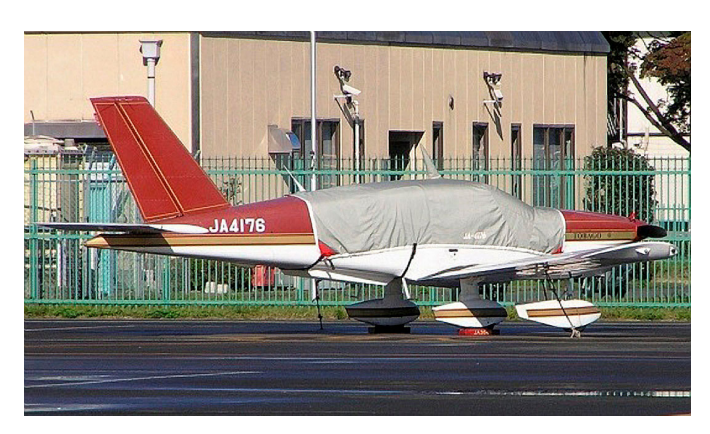
Socata TB-10 Tampico Canopy Cover