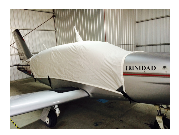
Trinidad Canopy Cover