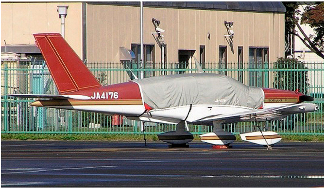
Socata TB-10 Tampico Canopy Cover