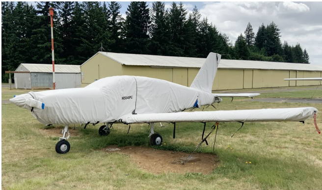
Socata Tampico TB-9C Cover Set

This cover type is made from Silver Acrylic Sunbrella canvas and is 100% lined with a soft and smooth microfiber. Bruce's Custom Covers developed this material combination especially for aircraft protection. The outer material is medium weight and treated for water resistance, UV resistance and anti-static buildup. The inner lining is a very soft and smooth microfiber to prevent scratching. The material is very reflective, and tests show that the cabin interior temperature can be reduced to near-ambient temperature on the hottest of days. It is water, ice and snow repellent, yet breathable to allow moisture to escape from between the cover and the aircraft surface.