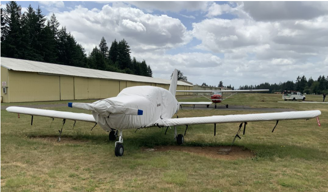
Socata Tampico TB-9C Cover Set

WINTER USE MATERIAL - Made with Solution-Dyed Polyester fabric, this option is intended for seasonal use to aid in deicing, rain mitigation, or for occasional travel. The material is lighter and more compact, but more susceptible to UV damage and may have a shorter useful life if used continuously outside than the all-year use material.