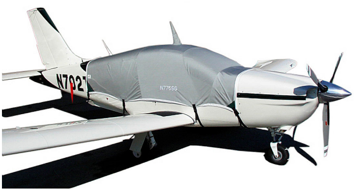
TB20 Standard Canopy Cover