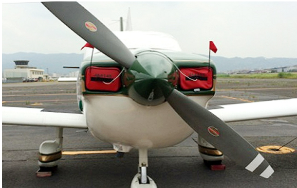
Socata TB-20 Engine Plugs