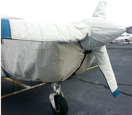
Socata Trinidad/Tobago Engine & Prop Covers