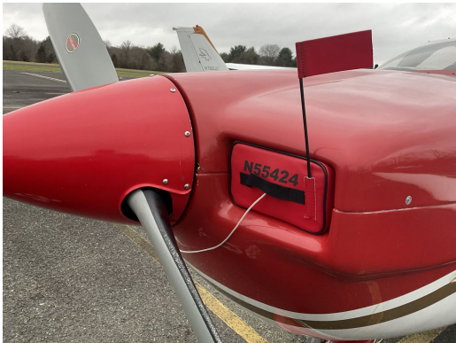
Socata Tobago Engine Plugs

Engine Inlet Plugs are custom fit for your Socata TB9-GT, Tobago: TB10-GT & TB200-GT, Trinidad: TB20-GT, TB21-GT intakes, made with heavy-duty vinyl material, and stuffed with a single block of sculpted urethane foam. Each plug has a zipper that allows the foam to be removed and dried if necessary. Engine plugs have warning flags that are visible from the cockpit or 'remove before flight' streamers sewn onto the face of the plugs. Most plugs are imprinted with the aircraft registration number in black for an extra charge. Storage bag NOT included. Engine plugs may be inserted after flight when the engine is still warm. Engine Inlet Plugs are commonly referred to as Cowl Plugs, Intake Plugs, Cowl Blocks, Engine Blocks, and Engine Bungs.