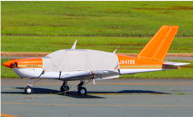
Socata TB-9 Tampico Canopy Cover