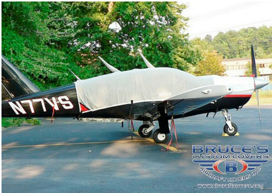
Socata TB20 Canopy Cover

This cover type is made from Silver Acrylic Sunbrella canvas and is 100% lined with a soft and smooth microfiber. Bruce's Custom Covers developed this material combination especially for aircraft protection. The outer material is medium weight and treated for water resistance, UV resistance and anti-static buildup. The inner lining is a very soft and smooth microfiber to prevent scratching. The material is very reflective, and tests show that the cabin interior temperature can be reduced to near-ambient temperature on the hottest of days. It is water, ice and snow repellent, yet breathable to allow moisture to escape from between the cover and the aircraft surface.