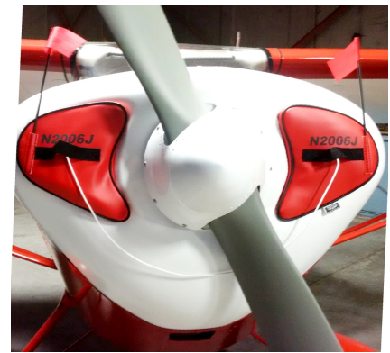
Taylorcraft Engine Inlet Plugs