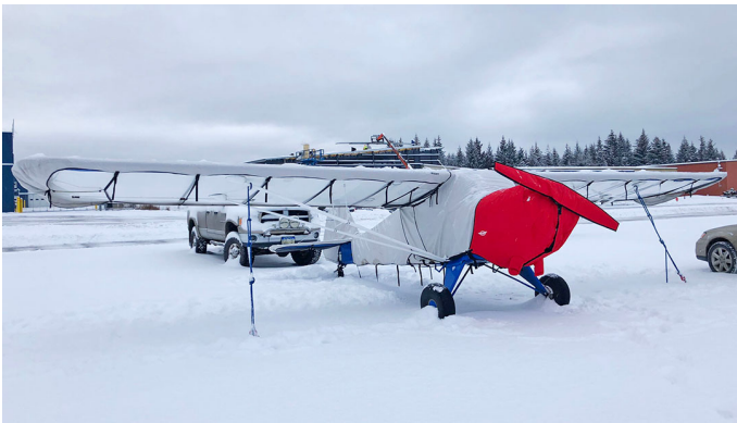
Taylorcraft Aviation Corp F19 Insulated Engine Cover