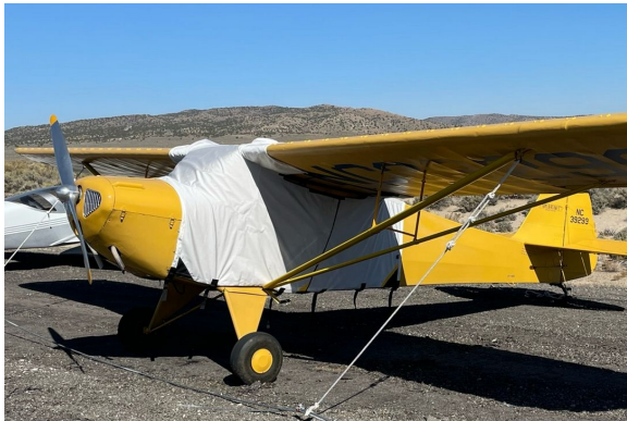
Taylorcraft BC-12D Extended Canopy Cover