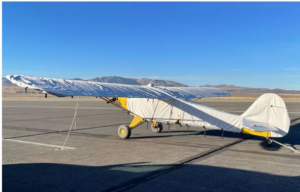
Taylorcraft BC-12D Extended Canopy, Wing & Empennage Covers

This cover type is made from Silver Acrylic Sunbrella canvas and is 100% lined with a soft and smooth microfiber. Bruce's Custom Covers developed this material combination especially for aircraft protection. The outer material is medium weight and treated for water resistance, UV resistance and anti-static buildup. The inner lining is a very soft and smooth microfiber to prevent scratching. The material is very reflective, and tests show that the cabin interior temperature can be reduced to near-ambient temperature on the hottest of days. It is water, ice and snow repellent, yet breathable to allow moisture to escape from between the cover and the aircraft surface.