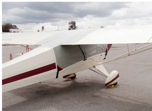
Taylorcraft Over-Top Canopy Cover