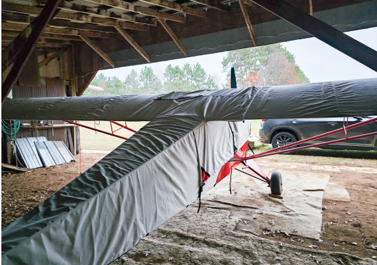
Taylorcraft BC12-D Empennage Cover (Tailboom, Vertical & Horiz Stabilizers) All Year Use