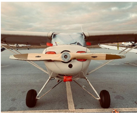
Taylorcraft Engine Inlet Plugs