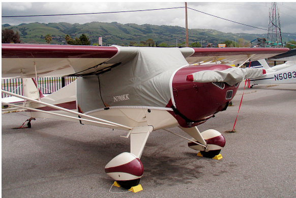
Taylorcraft Over-Top Canopy Cover

This cover type is made from Silver Acrylic Sunbrella canvas and is 100% lined with a soft and smooth microfiber. Bruce's Custom Covers developed this material combination especially for aircraft protection. The outer material is medium weight and treated for water resistance, UV resistance and anti-static buildup. The inner lining is a very soft and smooth microfiber to prevent scratching. The material is very reflective, and tests show that the cabin interior temperature can be reduced to near-ambient temperature on the hottest of days. It is water, ice and snow repellent, yet breathable to allow moisture to escape from between the cover and the aircraft surface.