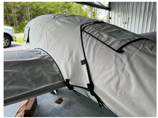
Pipistrel Taurus Complete Cover Set