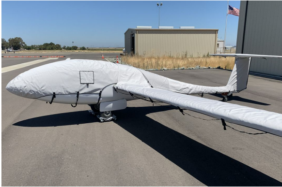
Pipistrel Taurus & Electro Canopy/Nose Cover, All Year Use

WINTER USE MATERIAL - Made with Solution-Dyed Polyester fabric, this option is intended for seasonal use to aid in deicing, rain mitigation, or for occasional travel. The material is lighter and more compact, but more susceptible to UV damage and may have a shorter useful life if used continuously outside than the all-year use material.