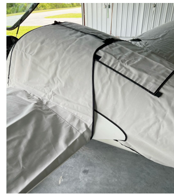
Pipistrel Taurus Complete Cover Set