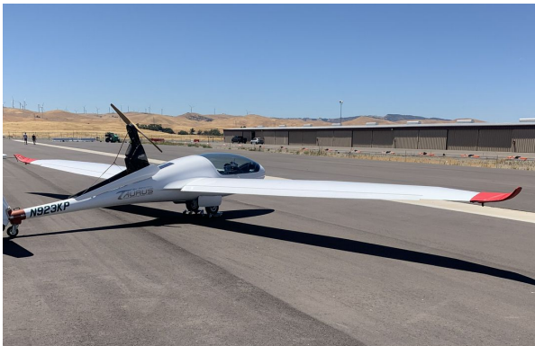
Pipistrel Taurus & Electro Wingtip Pads

Designed to prevent damage to the wingtip in crowded hangars or high traffic areas, these products are made of bright red Naugahyde and thickly padded with a sandwich of closed cell foam. Protects delicate winglets, casters and their housings, and soft finishes.