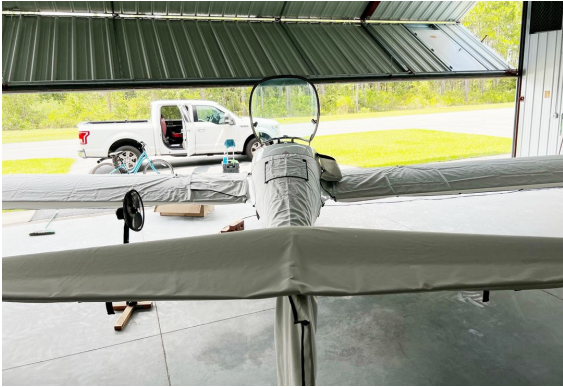
Pipistrel Taurus Complete Cover Set

WINTER USE MATERIAL - Made with Solution-Dyed Polyester fabric, this option is intended for seasonal use to aid in deicing, rain mitigation, or for occasional travel. The material is lighter and more compact, but more susceptible to UV damage and may have a shorter useful life if used continuously outside than the all-year use material.