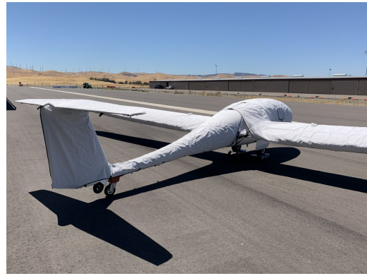
Pipistrel Taurus & Electro Empennage Cover, Incl. Horiz. Stab., All Year Use