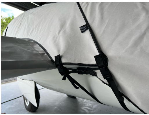
Pipistrel Taurus Complete Cover Set