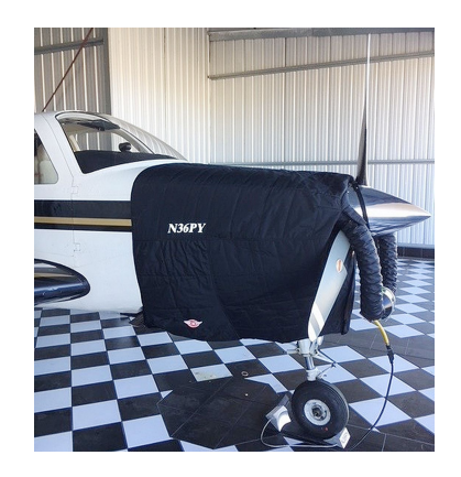
Beech Bonanza 36 Models Insulated Engine Cover

This cover type is made from Silver Acrylic Sunbrella canvas and is 100% lined with a soft and smooth microfiber. Bruce's Custom Covers developed this material combination especially for aircraft protection. The outer material is medium weight and treated for water resistance, UV resistance and anti-static buildup. The inner lining is a very soft and smooth microfiber to prevent scratching. The material is very reflective, and tests show that the cabin interior temperature can be reduced to near-ambient temperature on the hottest of days. It is water, ice and snow repellent, yet breathable to allow moisture to escape from between the cover and the aircraft surface.