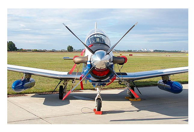
Texan II T6A Engine Inlet Plug, Prop Tie/Exhaust Covers