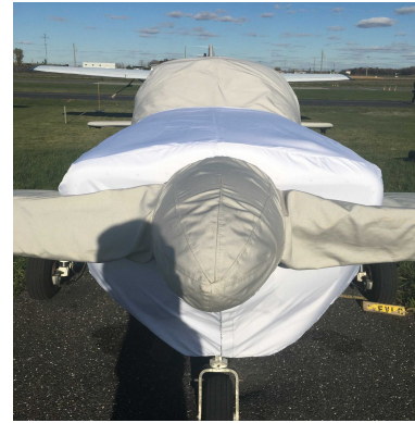
Slingsby T-67C Firefly Engine Cover, test fit cover