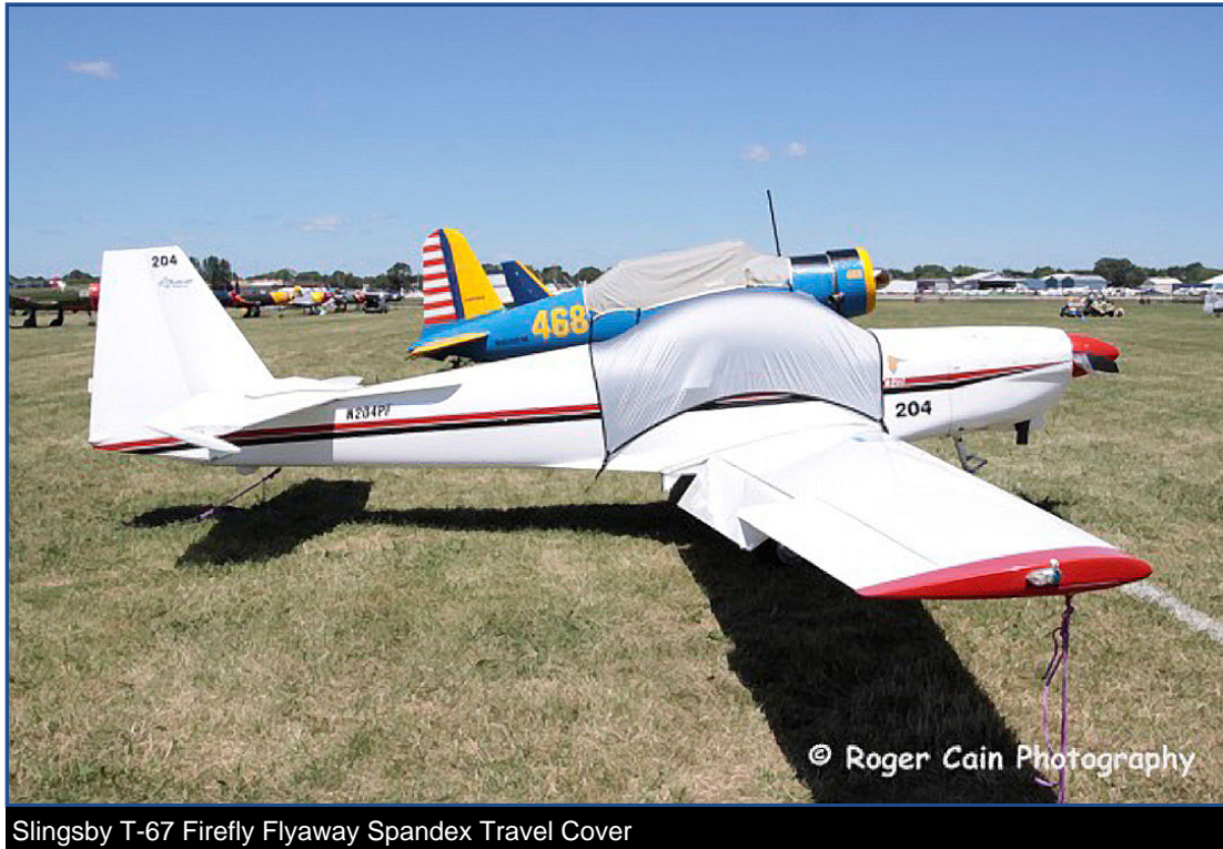
Slingsby T-67 Firefly Flyaway Spandex Travel Cover