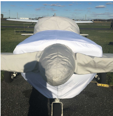
Slingsby T-67C Firefly Engine Cover, test fit cover