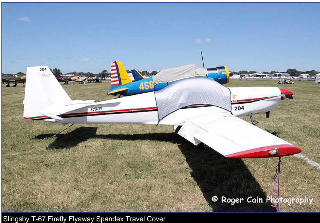
Slingsby T-67 Firefly Flyaway Spandex Travel Cover