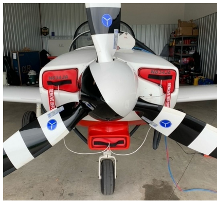
Slingsby T-67 Firefly Engine Inlet Plugs