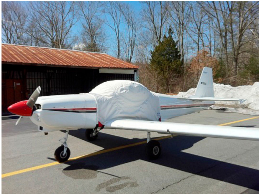
Slingsby T-67 Firefly Extended Canopy Cover