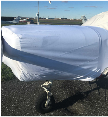
Slingsby T-67C Firefly Engine Cover, test fit cover

This cover type is made from Silver Acrylic Sunbrella canvas and is 100% lined with a soft and smooth microfiber. Bruce's Custom Covers developed this material combination especially for aircraft protection. The outer material is medium weight and treated for water resistance, UV resistance and anti-static buildup. The inner lining is a very soft and smooth microfiber to prevent scratching. The material is very reflective, and tests show that the cabin interior temperature can be reduced to near-ambient temperature on the hottest of days. It is water, ice and snow repellent, yet breathable to allow moisture to escape from between the cover and the aircraft surface.