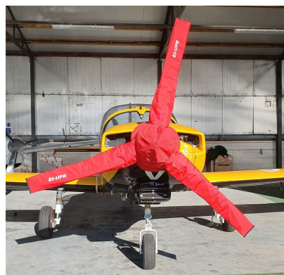
Slingsby T-67 Firefly Insulated Propellor/Spinner Cover