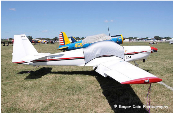
Slingsby T-67 Firefly Flyaway Spandex Travel Cover

This cover type is made from Silver Acrylic Sunbrella canvas and is 100% lined with a soft and smooth microfiber. Bruce's Custom Covers developed this material combination especially for aircraft protection. The outer material is medium weight and treated for water resistance, UV resistance and anti-static buildup. The inner lining is a very soft and smooth microfiber to prevent scratching. The material is very reflective, and tests show that the cabin interior temperature can be reduced to near-ambient temperature on the hottest of days. It is water, ice and snow repellent, yet breathable to allow moisture to escape from between the cover and the aircraft surface.