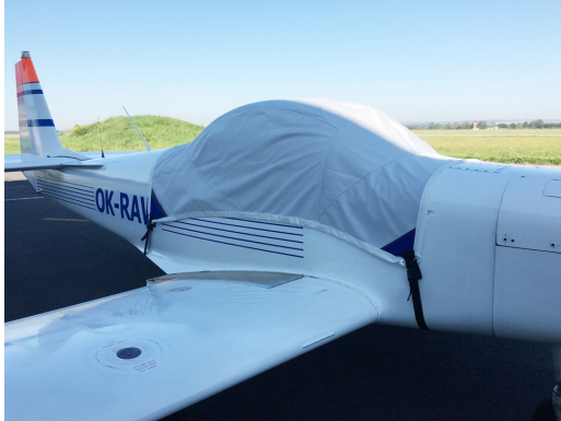
Slingsby T-67 Firefly Canopy Cover

This cover type is made from Silver Acrylic Sunbrella canvas and is 100% lined with a soft and smooth microfiber. Bruce's Custom Covers developed this material combination especially for aircraft protection. The outer material is medium weight and treated for water resistance, UV resistance and anti-static buildup. The inner lining is a very soft and smooth microfiber to prevent scratching. The material is very reflective, and tests show that the cabin interior temperature can be reduced to near-ambient temperature on the hottest of days. It is water, ice and snow repellent, yet breathable to allow moisture to escape from between the cover and the aircraft surface.