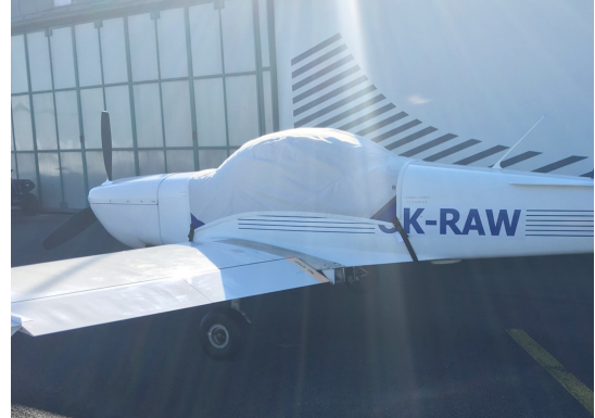
Slingsby T-67 Firefly Canopy Cover