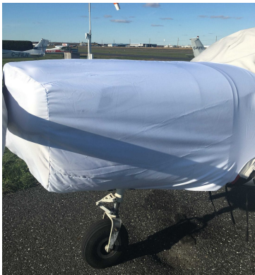
Slingsby T-67C Firefly Engine Cover, test fit cover

This cover type is made from Silver Acrylic Sunbrella canvas and is 100% lined with a soft and smooth microfiber. Bruce's Custom Covers developed this material combination especially for aircraft protection. The outer material is medium weight and treated for water resistance, UV resistance and anti-static buildup. The inner lining is a very soft and smooth microfiber to prevent scratching. The material is very reflective, and tests show that the cabin interior temperature can be reduced to near-ambient temperature on the hottest of days. It is water, ice and snow repellent, yet breathable to allow moisture to escape from between the cover and the aircraft surface.