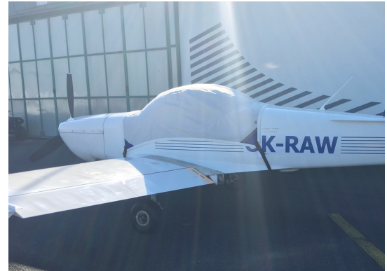
Slingsby T-67 Firefly Canopy Cover