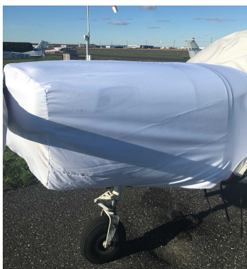
Slingsby T-67C Firefly Engine Cover, test fit cover

This cover type is made from Silver Acrylic Sunbrella canvas and is 100% lined with a soft and smooth microfiber. Bruce's Custom Covers developed this material combination especially for aircraft protection. The outer material is medium weight and treated for water resistance, UV resistance and anti-static buildup. The inner lining is a very soft and smooth microfiber to prevent scratching. The material is very reflective, and tests show that the cabin interior temperature can be reduced to near-ambient temperature on the hottest of days. It is water, ice and snow repellent, yet breathable to allow moisture to escape from between the cover and the aircraft surface.