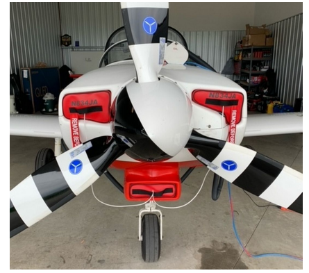
ENGINE PLUGS PREVENT BIRD NEST FOD. Piper Saratoga Engine Cowling Bird's Nest Slingsby T-67 Firefly Engine Inlet Plugs