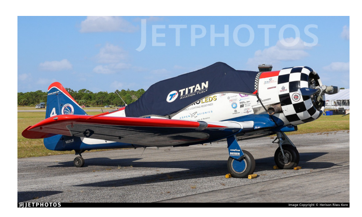
North American T6, SNJ, Harvard Canopy Cover With 30" Fwd Ext (Multi-Piece Back Glass)

This cover type is made from Silver Acrylic Sunbrella canvas and is 100% lined with a soft and smooth microfiber. Bruce's Custom Covers developed this material combination especially for aircraft protection. The outer material is medium weight and treated for water resistance, UV resistance and anti-static buildup. The inner lining is a very soft and smooth microfiber to prevent scratching. The material is very reflective, and tests show that the cabin interior temperature can be reduced to near-ambient temperature on the hottest of days. It is water, ice and snow repellent, yet breathable to allow moisture to escape from between the cover and the aircraft surface.