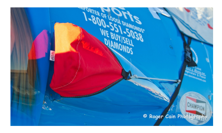
North American T6 Carb Air Scoop Cover