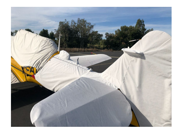
North American T6 Empennage Cover