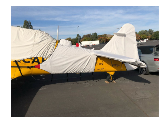
North American T6 Empennage Cover

WINTER USE MATERIAL - Made with Solution-Dyed Polyester fabric, this option is intended for seasonal use to aid in deicing, rain mitigation, or for occasional travel. The material is lighter and more compact, but more susceptible to UV damage and may have a shorter useful life if used continuously outside than the all-year use material.