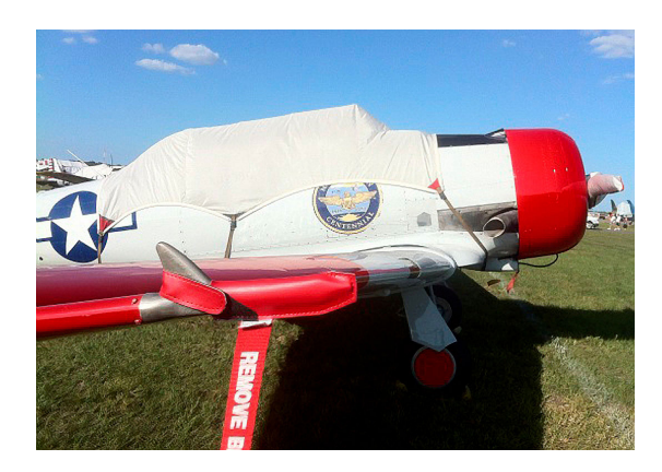
T6 Pitot, Canopy & Prop Covers

Engine Inlet Plugs are custom fit for your North American T6, SNJ, Harvard intakes, made with heavy-duty vinyl material, and stuffed with a single block of sculpted urethane foam. Each plug has a zipper that allows the foam to be removed and dried if necessary. Engine plugs have warning flags that are visible from the cockpit or 'remove before flight' streamers sewn onto the face of the plugs. Most plugs are imprinted with the aircraft registration number in black for an extra charge. Storage bag NOT included. Engine plugs may be inserted after flight when the engine is still warm. Engine Inlet Plugs are commonly referred to as Cowl Plugs, Intake Plugs, Cowl Blocks, Engine Blocks, and Engine Bungs.