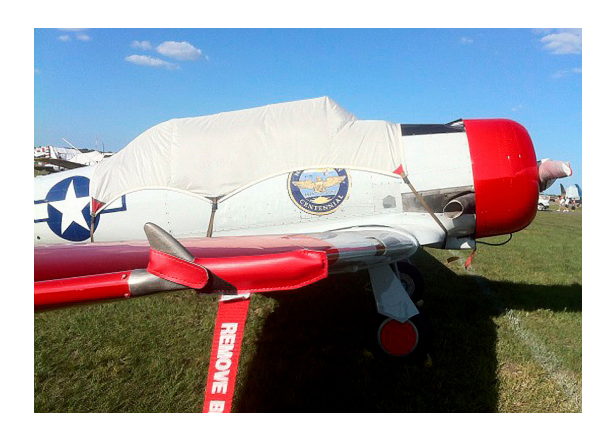
T6 Pitot, Canopy & Prop Covers

Travel Covers are made with Silver Solution-Dyed Polyester fabric and only lined over the windshield to save weight. The material is lightweight and more compact for easy stowage in the aircraft. The polyester material is water resistant, but only intended for occasional use outside. We also have an ultra lightweight material available for fitted hangar dust covers. For daily outdoor use, the non-travel Sunbrella Cover is the best choice.