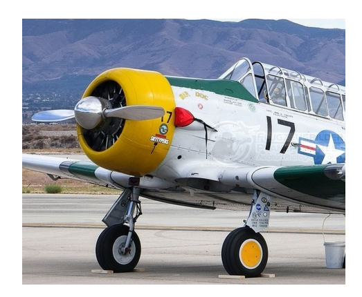
North American T6 Carb Air Scoop Cover