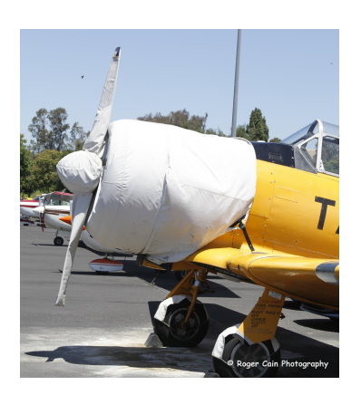
North American T6 Engine & Prop Cover