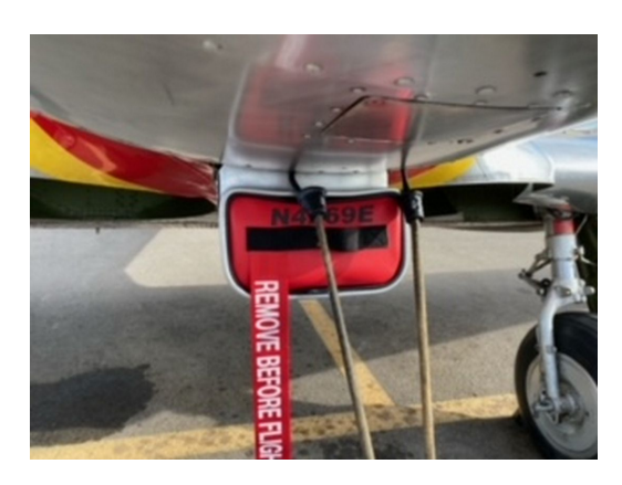
North American T6 Chin Scoop Plug