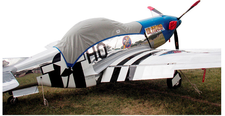
Stewart Mustang Canopy Cover, Prop Tie Downs & Intake Plugs Stewart Mustang Canopy Cover, Prop Tie Downs & Intake Plugs