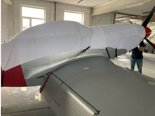
Scalewings SW-51 Mustang Canopy & Engine Covers, test fit covers

This cover type is made from Silver Acrylic Sunbrella canvas and is 100% lined with a soft and smooth microfiber. Bruce's Custom Covers developed this material combination especially for aircraft protection. The outer material is medium weight and treated for water resistance, UV resistance and anti-static buildup. The inner lining is a very soft and smooth microfiber to prevent scratching. The material is very reflective, and tests show that the cabin interior temperature can be reduced to near-ambient temperature on the hottest of days. It is water, ice and snow repellent, yet breathable to allow moisture to escape from between the cover and the aircraft surface.