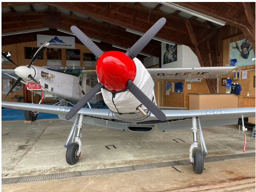
SW-51 Mustang Engine Cover