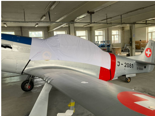
Scalewings SW-51 Mustang Canopy Cover, test fit cover

This cover type is made from Silver Acrylic Sunbrella canvas and is 100% lined with a soft and smooth microfiber. Bruce's Custom Covers developed this material combination especially for aircraft protection. The outer material is medium weight and treated for water resistance, UV resistance and anti-static buildup. The inner lining is a very soft and smooth microfiber to prevent scratching. The material is very reflective, and tests show that the cabin interior temperature can be reduced to near-ambient temperature on the hottest of days. It is water, ice and snow repellent, yet breathable to allow moisture to escape from between the cover and the aircraft surface.