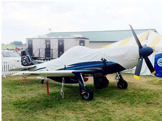
Thunder Mustang Canopy & Engine Cover

This cover type is made from Silver Acrylic Sunbrella canvas and is 100% lined with a soft and smooth microfiber. Bruce's Custom Covers developed this material combination especially for aircraft protection. The outer material is medium weight and treated for water resistance, UV resistance and anti-static buildup. The inner lining is a very soft and smooth microfiber to prevent scratching. The material is very reflective, and tests show that the cabin interior temperature can be reduced to near-ambient temperature on the hottest of days. It is water, ice and snow repellent, yet breathable to allow moisture to escape from between the cover and the aircraft surface.