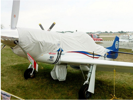
Thunder Mustang Canopy & Engine Cover

This cover type is made from Silver Acrylic Sunbrella canvas and is 100% lined with a soft and smooth microfiber. Bruce's Custom Covers developed this material combination especially for aircraft protection. The outer material is medium weight and treated for water resistance, UV resistance and anti-static buildup. The inner lining is a very soft and smooth microfiber to prevent scratching. The material is very reflective, and tests show that the cabin interior temperature can be reduced to near-ambient temperature on the hottest of days. It is water, ice and snow repellent, yet breathable to allow moisture to escape from between the cover and the aircraft surface.