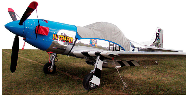
Stewart Mustang Canopy Cover, Prop Tie Downs & Intake Plugs