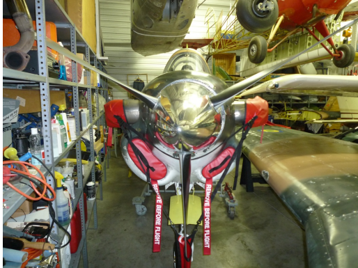
Beech T34C Engine Plugs, Prop Tie/Exhaust Plugs

Engine Inlet Plugs are custom fit for your Beech T34 Mentor (T-34, T-34C) intakes, made with heavy-duty vinyl material, and stuffed with a single block of sculpted urethane foam. Each plug has a zipper that allows the foam to be removed and dried if necessary. Engine plugs have warning flags that are visible from the cockpit or 'remove before flight' streamers sewn onto the face of the plugs. Most plugs are imprinted with the aircraft registration number in black for an extra charge. Storage bag NOT included. Engine plugs may be inserted after flight when the engine is still warm. Engine Inlet Plugs are commonly referred to as Cowl Plugs, Intake Plugs, Cowl Blocks, Engine Blocks, and Engine Bungs.