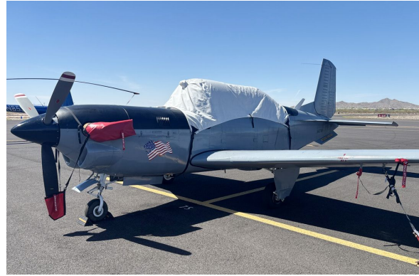
Beech T34 Mentor Prop Tie-Down/Exhaust Covers, Turboprop Model (T34c)