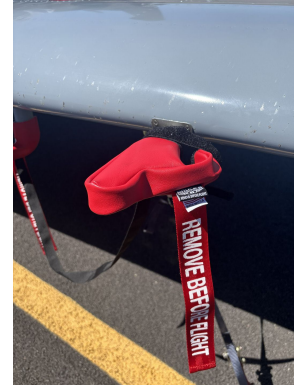
Beech T34 Mentor Pitot Cover and AOA Cover