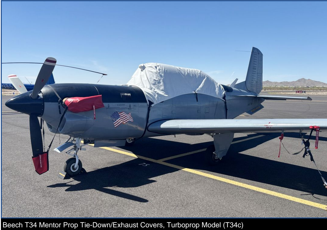
Beech T34 Mentor Prop Tie-Down/Exhaust Covers, Turboprop Model (T34c)