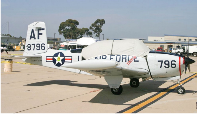
Beech T34 Canopy Cover

This cover type is made from Silver Acrylic Sunbrella canvas and is 100% lined with a soft and smooth microfiber. Bruce's Custom Covers developed this material combination especially for aircraft protection. The outer material is medium weight and treated for water resistance, UV resistance and anti-static buildup. The inner lining is a very soft and smooth microfiber to prevent scratching. The material is very reflective, and tests show that the cabin interior temperature can be reduced to near-ambient temperature on the hottest of days. It is water, ice and snow repellent, yet breathable to allow moisture to escape from between the cover and the aircraft surface.