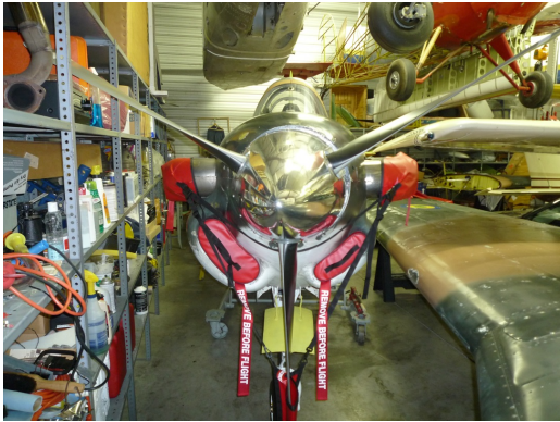
Beech T34C Engine Plugs, Prop Tie/Exhaust Plugs