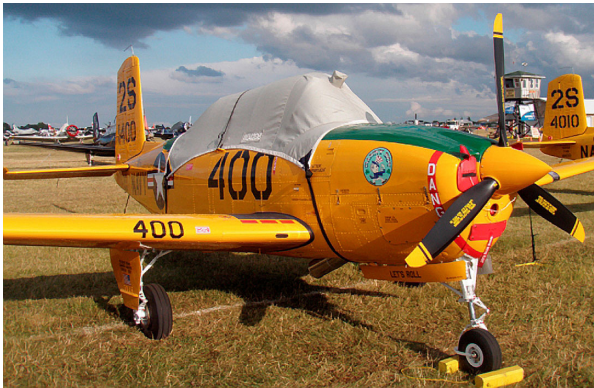
T34 Canopy Cover & Engine Inlet Plugs

This cover type is made from Silver Acrylic Sunbrella canvas and is 100% lined with a soft and smooth microfiber. Bruce's Custom Covers developed this material combination especially for aircraft protection. The outer material is medium weight and treated for water resistance, UV resistance and anti-static buildup. The inner lining is a very soft and smooth microfiber to prevent scratching. The material is very reflective, and tests show that the cabin interior temperature can be reduced to near-ambient temperature on the hottest of days. It is water, ice and snow repellent, yet breathable to allow moisture to escape from between the cover and the aircraft surface.