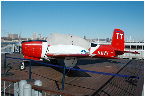
Beech T34 Canopy Cover