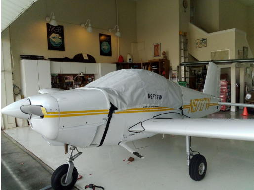
Thorp Sky Scooter T211 Canopy Cover

This cover type is made from Silver Acrylic Sunbrella canvas and is 100% lined with a soft and smooth microfiber. Bruce's Custom Covers developed this material combination especially for aircraft protection. The outer material is medium weight and treated for water resistance, UV resistance and anti-static buildup. The inner lining is a very soft and smooth microfiber to prevent scratching. The material is very reflective, and tests show that the cabin interior temperature can be reduced to near-ambient temperature on the hottest of days. It is water, ice and snow repellent, yet breathable to allow moisture to escape from between the cover and the aircraft surface.