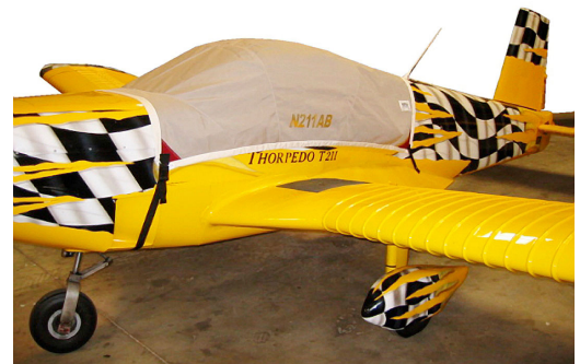
Indus Thorpedo Canopy Cover