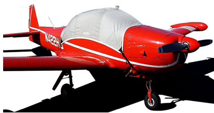
Standard Canopy Cover on Long Slope Windshield Model

Covers developed this material combination especially for aircraft protection. The outer material is medium weight and treated for water resistance, UV resistance and anti-static buildup. The inner lining is a very soft and smooth microfiber to prevent scratching. The material is very reflective, and tests show that the cabin interior temperature can be reduced to near-ambient temperature on the hottest of days. It is water, ice and snow repellent, yet breathable to allow moisture to escape from between the cover and the aircraft surface.