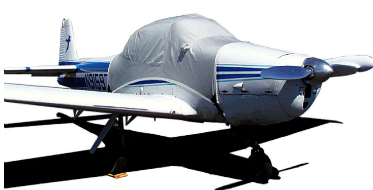
Navion Canopy Cover extends forward to firewall line.