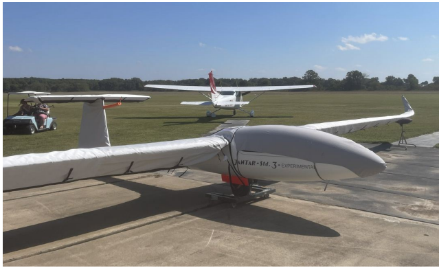
PdpS Pzl-Bielsko SZD-48-3