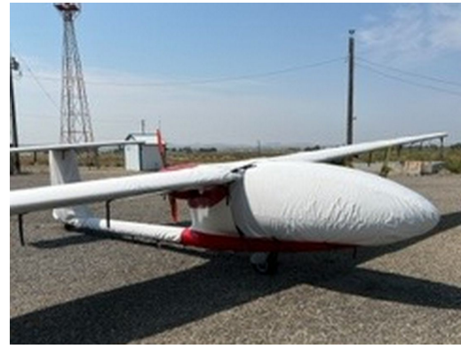
SZD-45 Ogar Canopy/Nose, Wings & Empennage Covers