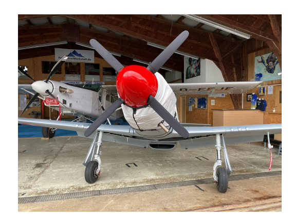
SW-51 Mustang Engine Cover

Covers developed this material combination especially for aircraft protection. The outer material is medium weight and treated for water resistance, UV resistance and anti-static buildup. The inner lining is a very soft and smooth microfiber to prevent scratching. The material is very reflective, and tests show that the cabin interior temperature can be reduced to near-ambient temperature on the hottest of days. It is water, ice and snow repellent, yet breathable to allow moisture to escape from between the cover and the aircraft surface.