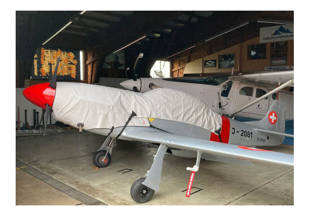
SW-51 Mustang Canopy & Engine Covers