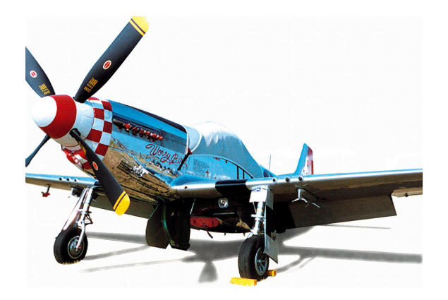
Canopy Cover, Belly & Chin Scoop Plugs