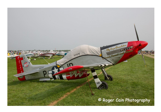
Titan Mustang Canopy Cover

the hottest of days. It is water, ice and snow repellent, yet breathable to allow moisture to escape from between the cover and the aircraft surface.