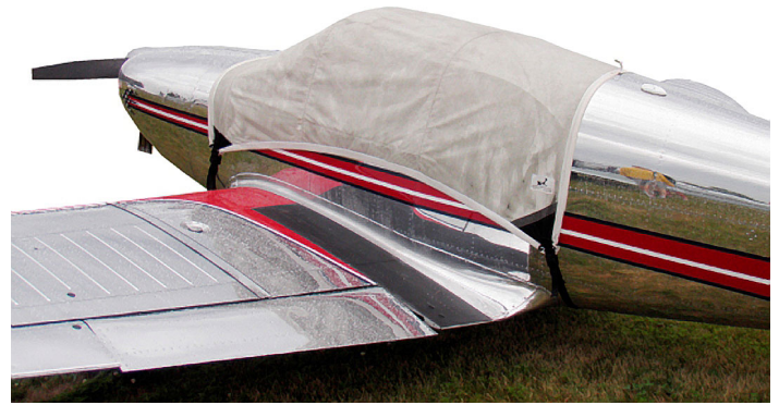
Swift Canopy Cover