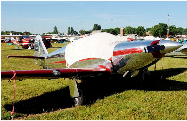
Standard Canopy Cover for Swift

This cover type is made from Silver Acrylic Sunbrella canvas and is 100% lined with a soft and smooth microfiber. Bruce's Custom Covers developed this material combination especially for aircraft protection. The outer material is medium weight and treated for water resistance, UV resistance and anti-static buildup. The inner lining is a very soft and smooth microfiber to prevent scratching. The material is very reflective, and tests show that the cabin interior temperature can be reduced to near-ambient temperature on the hottest of days. It is water, ice and snow repellent, yet breathable to allow moisture to escape from between the cover and the aircraft surface.