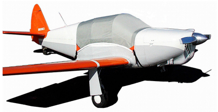
Standard Canopy Cover for Swift