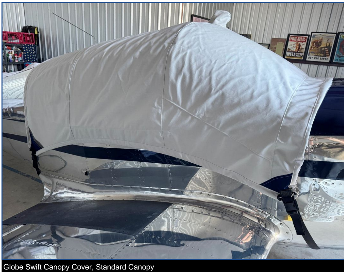
Globe Swift Canopy Cover, Standard Canopy