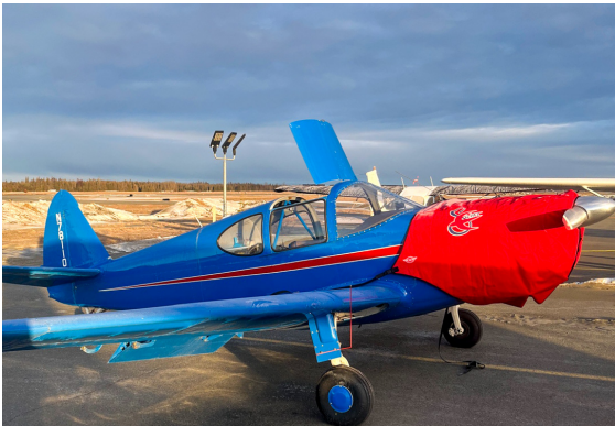
Globe Swift Insulated Engine Cover

This cover type is made from Silver Acrylic Sunbrella canvas and is 100% lined with a soft and smooth microfiber. Bruce's Custom Covers developed this material combination especially for aircraft protection. The outer material is medium weight and treated for water resistance, UV resistance and anti-static buildup. The inner lining is a very soft and smooth microfiber to prevent scratching. The material is very reflective, and tests show that the cabin interior temperature can be reduced to near-ambient temperature on the hottest of days. It is water, ice and snow repellent, yet breathable to allow moisture to escape from between the cover and the aircraft surface.