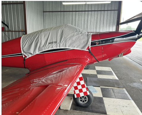
Swift Travel Cover, Light Weight Canopy Cover (Standard Canopy)

Travel Covers are made with Silver Solution-Dyed Polyester fabric and only lined over the windshield to save weight. The material is lightweight and more compact for easy stowage in the aircraft. The polyester material is water resistant, but only intended for occasional use outside. We also have an ultra lightweight material available for fitted hangar dust covers. For daily outdoor use, the non-travel Sunbrella Cover is the best choice.