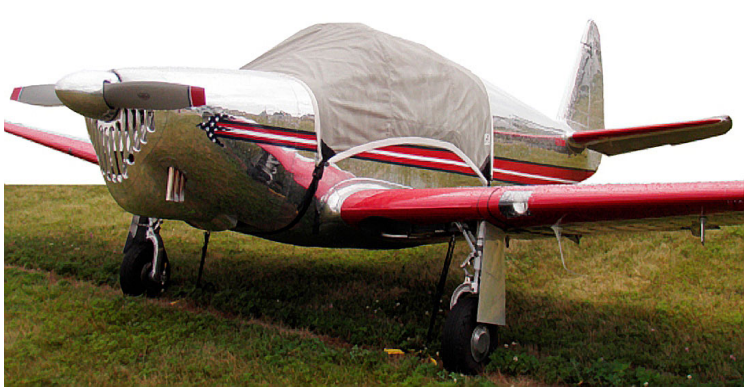
Swift Canopy Cover

This cover type is made from Silver Acrylic Sunbrella canvas and is 100% lined with a soft and smooth microfiber. Bruce's Custom Covers developed this material combination especially for aircraft protection. The outer material is medium weight and treated for water resistance, UV resistance and anti-static buildup. The inner lining is a very soft and smooth microfiber to prevent scratching. The material is very reflective, and tests show that the cabin interior temperature can be reduced to near-ambient temperature on the hottest of days. It is water, ice and snow repellent, yet breathable to allow moisture to escape from between the cover and the aircraft surface.