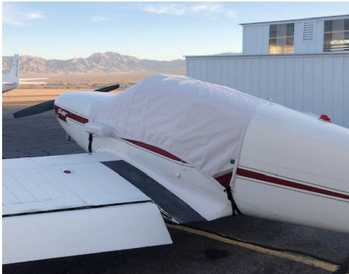
Globe-Temco Swift Canopy Cover, standard type