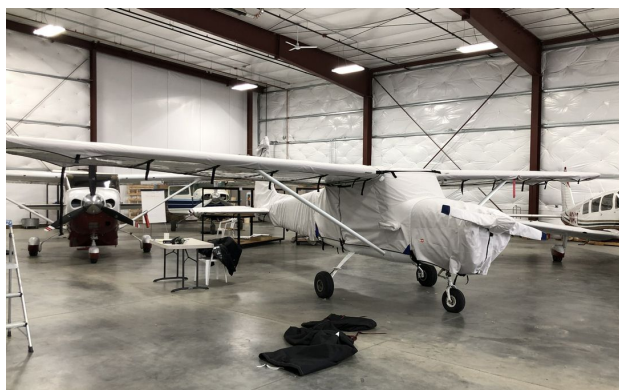
Cessna 172 (1956) Full Cover Set

WINTER USE MATERIAL - Made with Solution-Dyed Polyester fabric, this option is intended for seasonal use to aid in deicing, rain mitigation, or for occasional travel. The material is lighter and more compact, but more susceptible to UV damage and may have a shorter useful life if used continuously outside than the all-year use material.