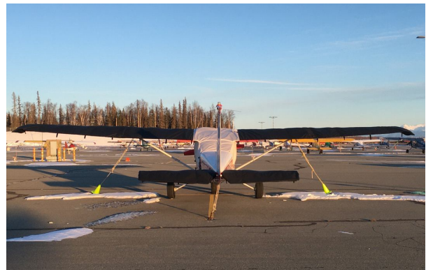
Cessna 172M Canopy, Wings, Horiz. Stab., Insulated Engine & Prop Covers