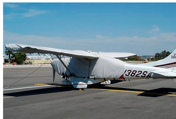
Wing Covers on Cessna 206