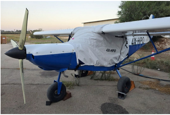
Savannah S Canopy Cover