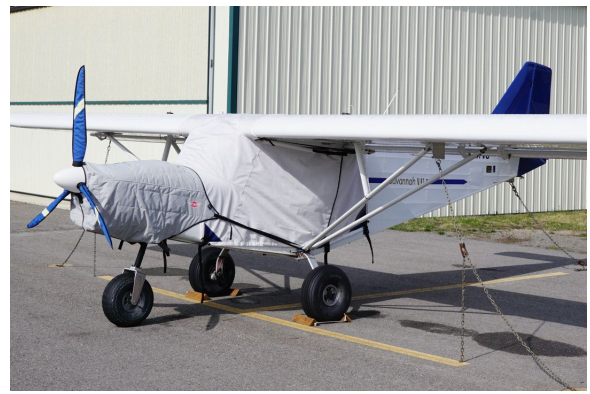
Savannah VG Canopy Cover, Insulated Engine Cover