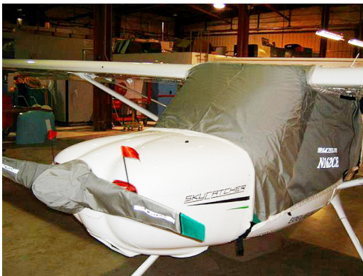
Cessna Skycatcher Standard Canopy Cover, Propellor Cover & Engine Inlet Plugs

Engine Inlet Plugs are custom fit for your Savannah VG & S Models intakes, made with heavy-duty vinyl material, and stuffed with a single block of sculpted urethane foam. Each plug has a zipper that allows the foam to be removed and dried if necessary. Engine plugs have warning flags that are visible from the cockpit or 'remove before flight' streamers sewn onto the face of the plugs. Most plugs are imprinted with the aircraft registration number in black for an extra charge. Storage bag NOT included. Engine plugs may be inserted after flight when the engine is still warm. Engine Inlet Plugs are commonly referred to as Cowl Plugs, Intake Plugs, Cowl Blocks, Engine Blocks, and Engine Bungs.