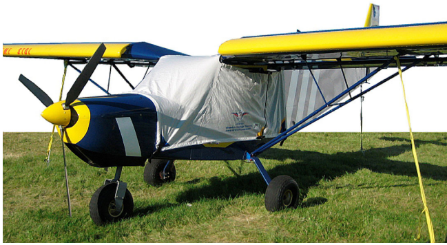
Zenith 701 Standard Canopy Cover