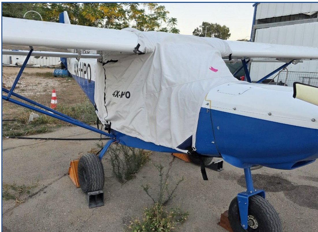
Savannah S Canopy Cover