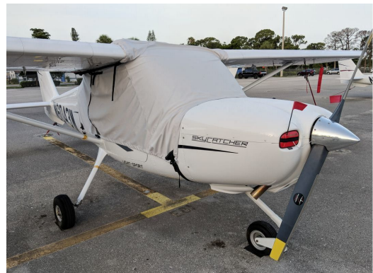
Cessna Skycatcher 162 Canopy Cover and Engine Inlet Plugs