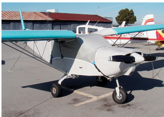
Zenith 801 Standard Canopy Cover

This cover type is made from Silver Acrylic Sunbrella canvas and is 100% lined with a soft and smooth microfiber. Bruce's Custom Covers developed this material combination especially for aircraft protection. The outer material is medium weight and treated for water resistance, UV resistance and anti-static buildup. The inner lining is a very soft and smooth microfiber to prevent scratching. The material is very reflective, and tests show that the cabin interior temperature can be reduced to near-ambient temperature on the hottest of days. It is water, ice and snow repellent, yet breathable to allow moisture to escape from between the cover and the aircraft surface.