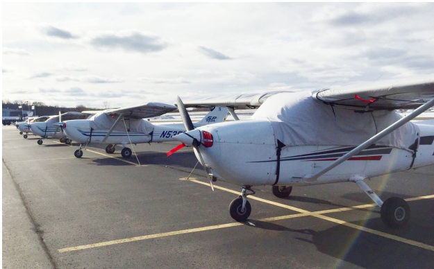
Cessna 172 Canopy Cover, Engine Plugs, Wing Covers