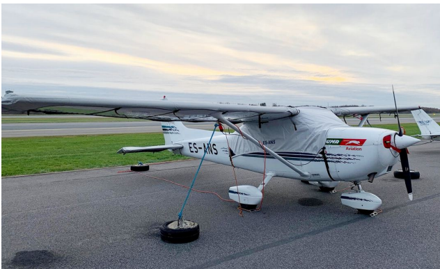
Cessna 172R Canopy Cover Wrap Around

WINTER USE MATERIAL - Made with Solution-Dyed Polyester fabric, this option is intended for seasonal use to aid in deicing, rain mitigation, or for occasional travel. The material is lighter and more compact, but more susceptible to UV damage and may have a shorter useful life if used continuously outside than the all-year use material.