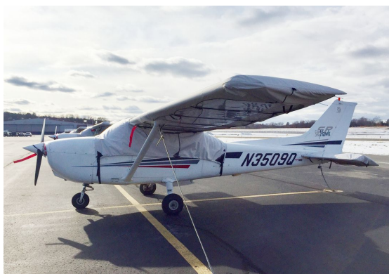
Cessna 172 Engine Plugs and Canopy, Wing, Horizontal Stabilizer Covers

WINTER USE MATERIAL - Made with Solution-Dyed Polyester fabric, this option is intended for seasonal use to aid in deicing, rain mitigation, or for occasional travel. The material is lighter and more compact, but more susceptible to UV damage and may have a shorter useful life if used continuously outside than the all-year use material.