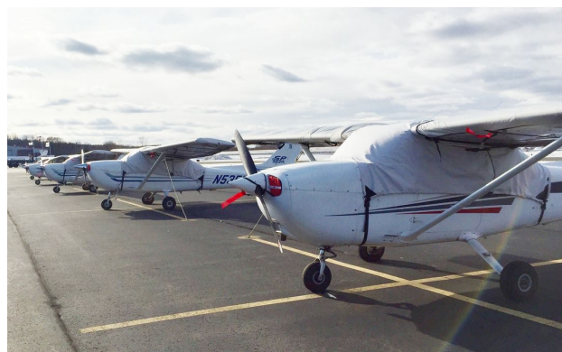
Cessna 172 Canopy Cover, Engine Plugs, Wing Covers