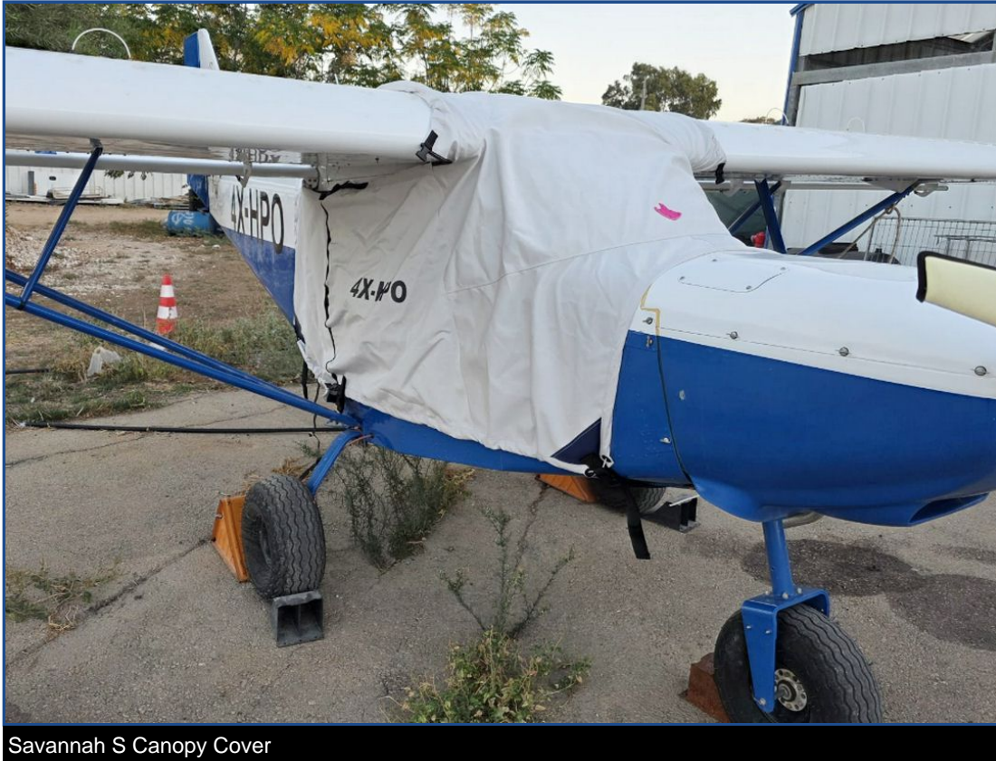
Savannah S Canopy Cover