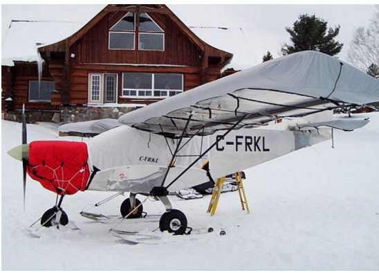
Zenith 801 Insulated Engine, Canopy, Wing & Tail Covers