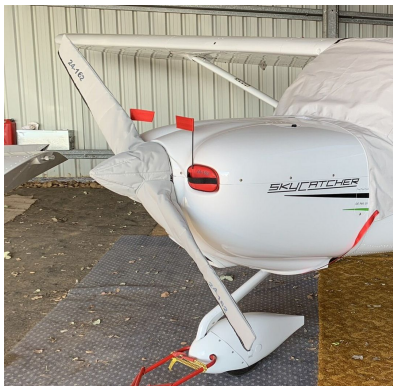
Cessna Skycatcher Prop/Spinner Cover, Engine Plugs

Engine Inlet Plugs are custom fit for your Savannah VG & S Models intakes, made with heavy-duty vinyl material, and stuffed with a single block of sculpted urethane foam. Each plug has a zipper that allows the foam to be removed and dried if necessary. Engine plugs have warning flags that are visible from the cockpit or 'remove before flight' streamers sewn onto the face of the plugs. Most plugs are imprinted with the aircraft registration number in black for an extra charge. Storage bag NOT included. Engine plugs may be inserted after flight when the engine is still warm. Engine Inlet Plugs are commonly referred to as Cowl Plugs, Intake Plugs, Cowl Blocks, Engine Blocks, and Engine Bungs.