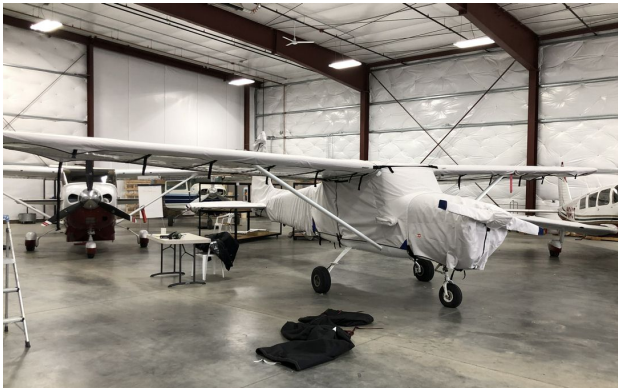
Cessna 172 (1956) Full Cover Set

WINTER USE MATERIAL - Made with Solution-Dyed Polyester fabric, this option is intended for seasonal use to aid in deicing, rain mitigation, or for occasional travel. The material is lighter and more compact, but more susceptible to UV damage and may have a shorter useful life if used continuously outside than the all-year use material.