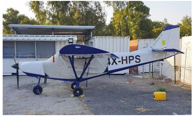
Savannah VG Canopy Cover, Over-Top Type