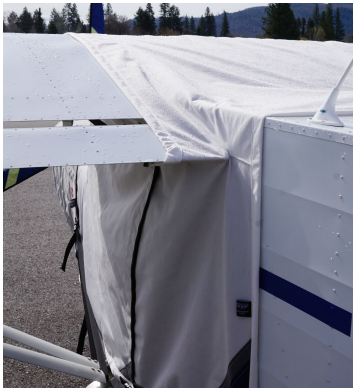
Savannah VG Canopy Cover