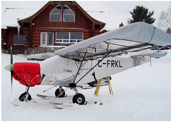
Zenith 801 Insulated Engine, Canopy, Wing & Tail Covers