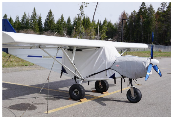
Savannah VG Canopy Cover, Insulated Engine Cover