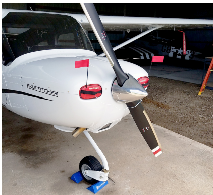
Cessna Skycatcher 162 Engine Inlet Plugs

Engine Inlet Plugs are custom fit for your Savannah VG & S Models intakes, made with heavy-duty vinyl material, and stuffed with a single block of sculpted urethane foam. Each plug has a zipper that allows the foam to be removed and dried if necessary. Engine plugs have warning flags that are visible from the cockpit or 'remove before flight' streamers sewn onto the face of the plugs. Most plugs are imprinted with the aircraft registration number in black for an extra charge. Storage bag NOT included. Engine plugs may be inserted after flight when the engine is still warm. Engine Inlet Plugs are commonly referred to as Cowl Plugs, Intake Plugs, Cowl Blocks, Engine Blocks, and Engine Bungs.