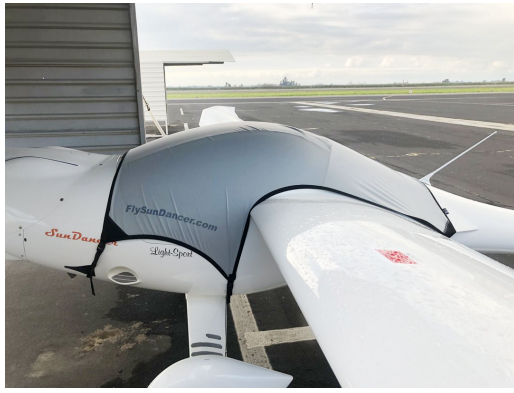
SUNDANCER Travel Cover with custom Imprint