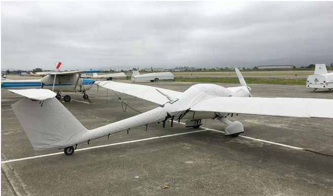
Distar Sundancer LSA Extended Canopy/Engine, Prop, Wheelpants, Wings & Empennage Covers

WINTER USE MATERIAL - Made with Solution-Dyed Polyester fabric, this option is intended for seasonal use to aid in deicing, rain mitigation, or for occasional travel. The material is lighter and more compact, but more susceptible to UV damage and may have a shorter useful life if used continuously outside than the all-year use material.