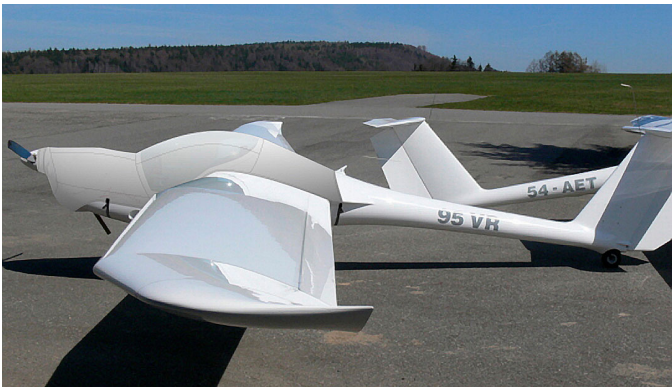
Lambada Canopy/Engine Cover (illustration)