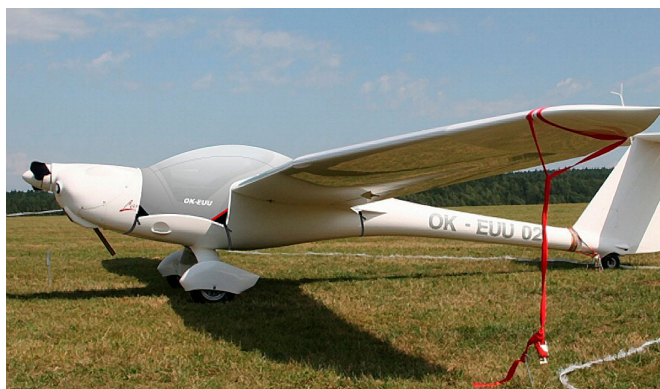
Lambda Canopy Cover (illustration)