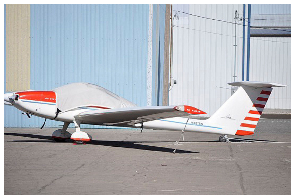
Grob 109 Canopy Cover