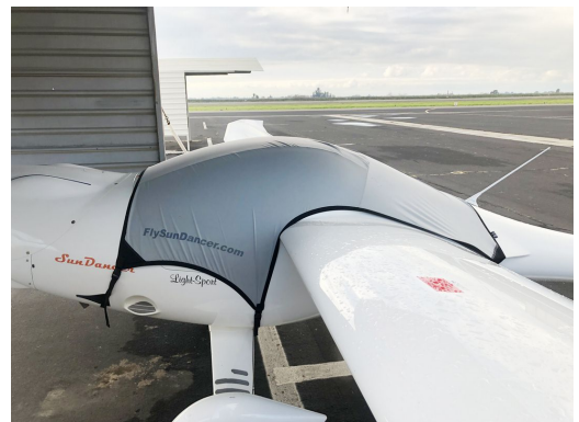
SUNDANCER Travel Cover with custom Imprint