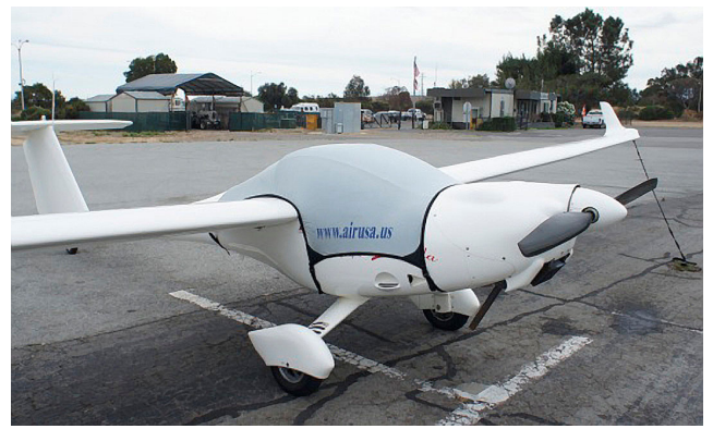
Lambada Travel Canopy Cover