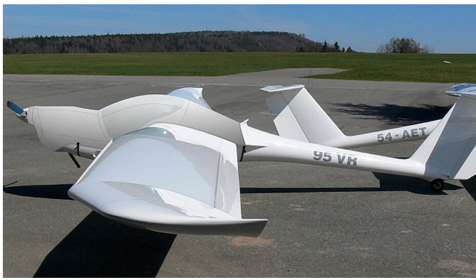
Lambda Canopy/Engine Cover (illustration)