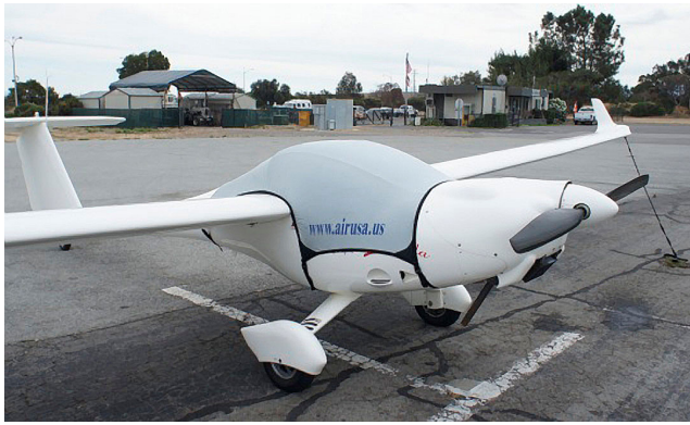
Lambda Travel Canopy Cover