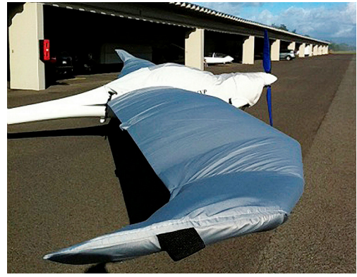
Lambda Canopy/Engine Cover and Wing Covers