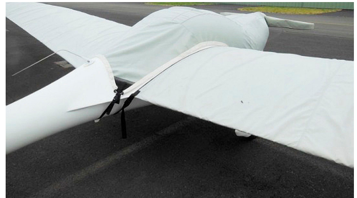
Lambda Canopy/Engine, Wing Covers