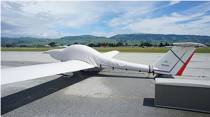
Grob 109 Canopy/Engine w/ extension to tail, Wing, Stabilizer & Prop/Spinner Covers