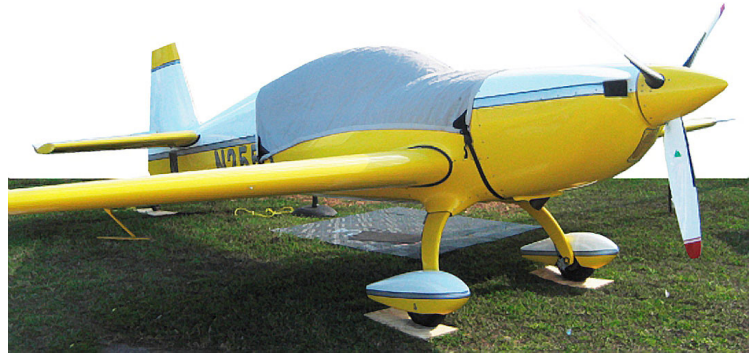
Extra 300/L Canopy Cover