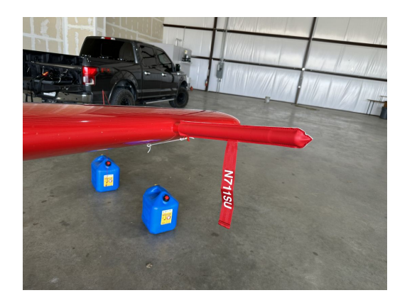
Sukhoi SU-26 Pitot Cover