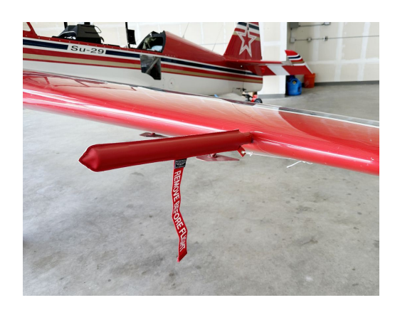
Sukhoi SU-26 Pitot Cover

Sukhoi SU-26 Pitot Tube Covers , NOT HEAT RESISTANT TYPE, are made of Naugahyde vinyl, and are designed to cover the entire pitot assembly. Slipping over the tube, the cover tightens around the base with a Velcro strap detail. A "Remove Before Flight" streamer is attached to the cover. Heat Resistant Pitot Covers are an upgrade to this design, and help prevent the pitot cover from melting onto the tube if the pitot heat is accidentally turned on while installed. If you want the set tethered together, please let us know.