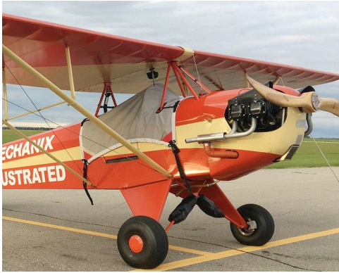
Corben Baby Ace Cockpit Cover