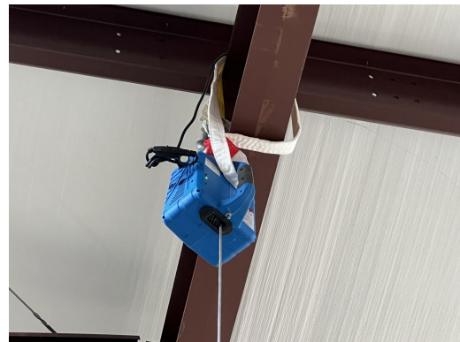
Stearman PT-13 Full Body Dust Cover, Remote Control Winch