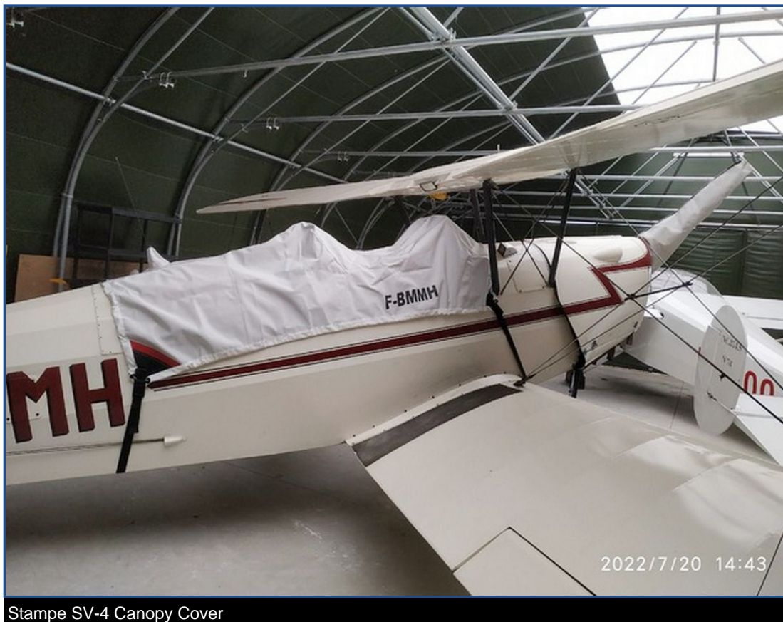
Stampe SV-4 Canopy Cover