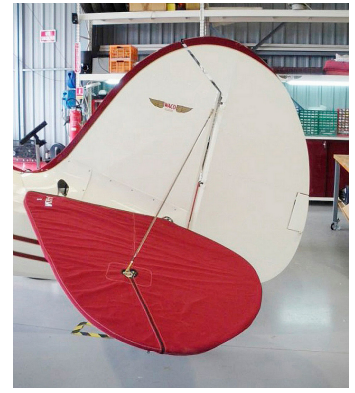
Waco UPF-7 Horizontal Stab. Cover