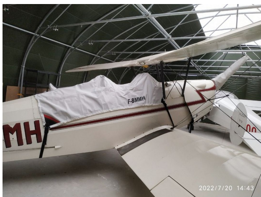
Stampe SV-4 Canopy Cover