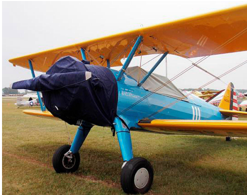
Stearman PT-13 Engine Cover

This cover type is made from Silver Acrylic Sunbrella canvas and is 100% lined with a soft and smooth microfiber. Bruce's Custom Covers developed this material combination especially for aircraft protection. The outer material is medium weight and treated for water resistance, UV resistance and anti-static buildup. The inner lining is a very soft and smooth microfiber to prevent scratching. The material is very reflective, and tests show that the cabin interior temperature can be reduced to near-ambient temperature on the hottest of days. It is water, ice and snow repellent, yet breathable to allow moisture to escape from between the cover and the aircraft surface.