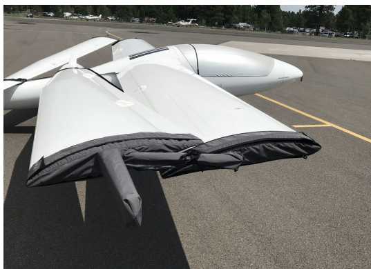
STEMME S10-VT WING FOLD COVERS

WINTER USE MATERIAL - Made with Solution-Dyed Polyester fabric, this option is intended for seasonal use to aid in deicing, rain mitigation, or for occasional travel. The material is lighter and more compact, but more susceptible to UV damage and may have a shorter useful life if used continuously outside than the all-year use material.