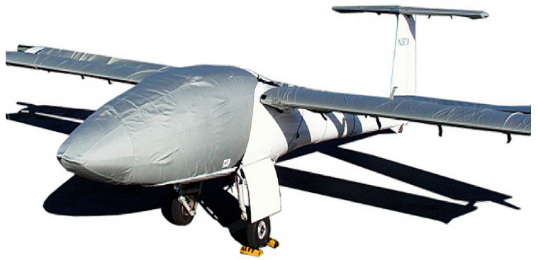
Stemme S-10 Wing Covers & Horiz. Stab. Covers