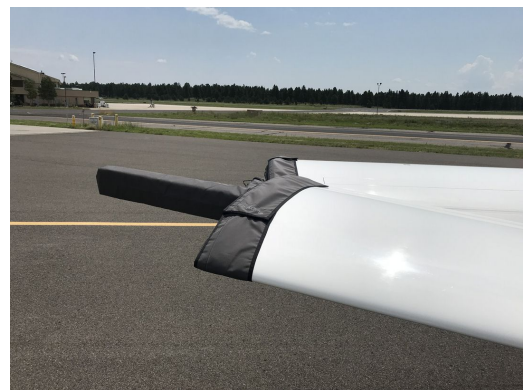
STEMME S10-VT WING FOLD COVERS