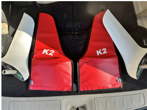
Discus CS Wingtip Pads (Set of 2)

Designed to prevent damage to the wingtip in crowded hangars or high traffic areas, these products are made of bright red Naugahyde and thickly padded with a sandwich of closed cell foam. Protects delicate winglets, casters and their housings, and soft finishes.