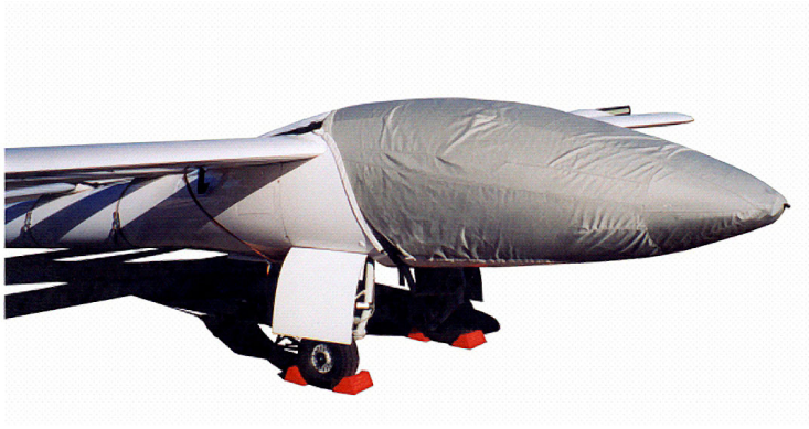
Stemme Cockpit/Nose Cover