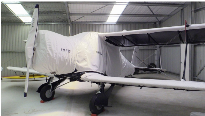
Beech Staggerwing Complete Cover Set

This cover type is made from Silver Acrylic Sunbrella canvas and is 100% lined with a soft and smooth microfiber. Bruce's Custom Covers developed this material combination especially for aircraft protection. The outer material is medium weight and treated for water resistance, UV resistance and anti-static buildup. The inner lining is a very soft and smooth microfiber to prevent scratching. The material is very reflective, and tests show that the cabin interior temperature can be reduced to near-ambient temperature on the hottest of days. It is water, ice and snow repellent, yet breathable to allow moisture to escape from between the cover and the aircraft surface.