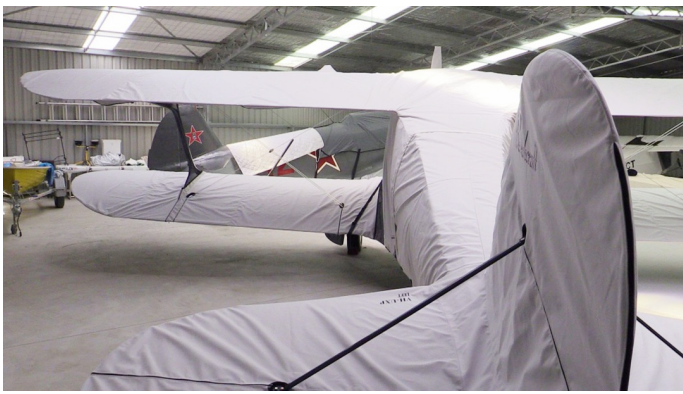
Beech Staggerwing Complete Cover Set