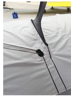
Beech Staggerwing Complete Cover Set, Lower Wing Detail