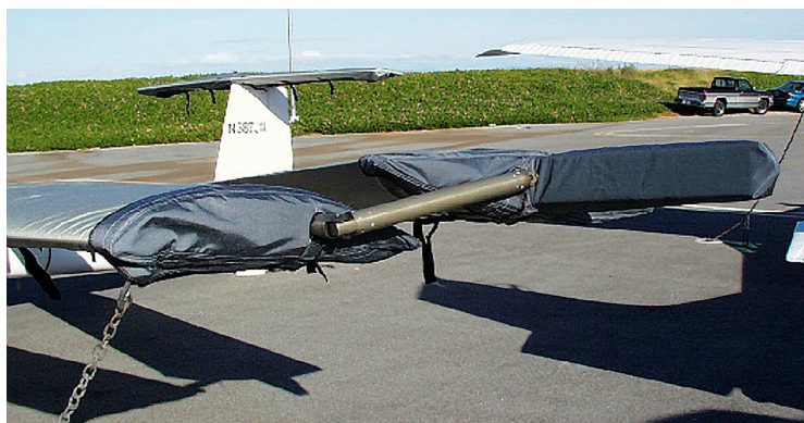
End Cap Covers are used when wing are in folded position.