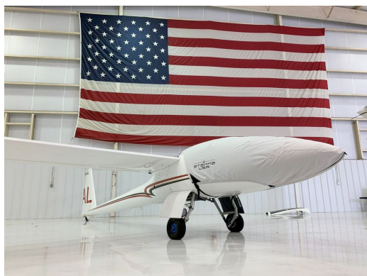
Stemme S-12 Canopy/Nose Cover