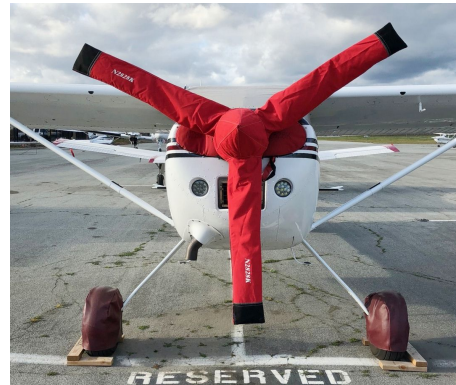
Cessna Skywagon Propellor/Spinner Cover, 3-blade type