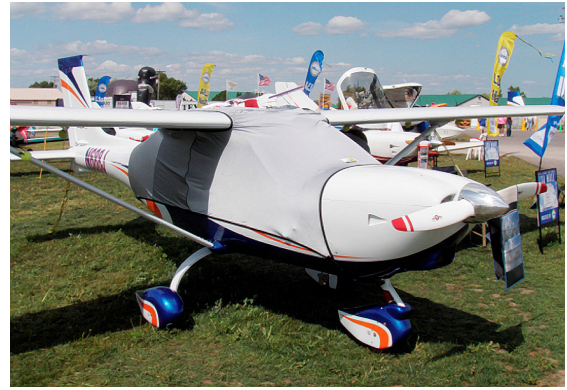
Jabiru Spandex FlyAway Travel Canopy Cover