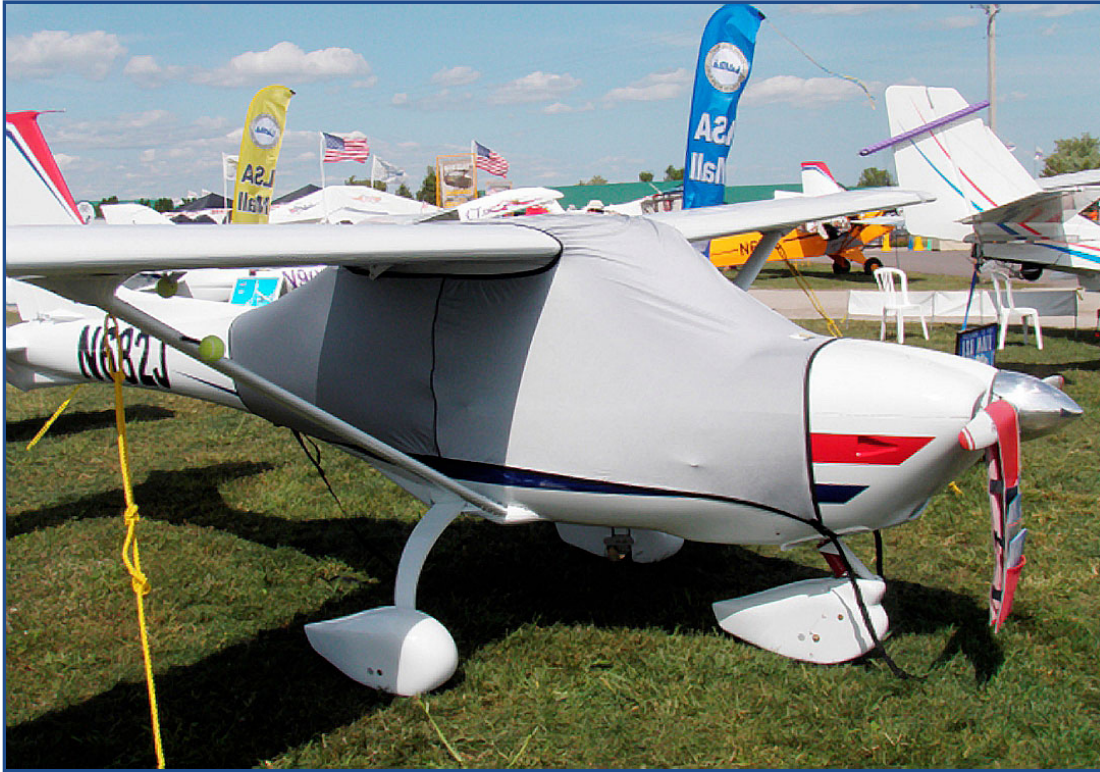
Jabiru Spandex FlyAway Travel Canopy Cover