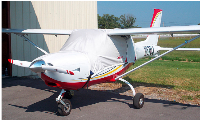
Jabiru 170 Canopy Cover