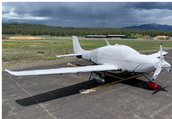
Cirrus SR22 Complete Cover Set