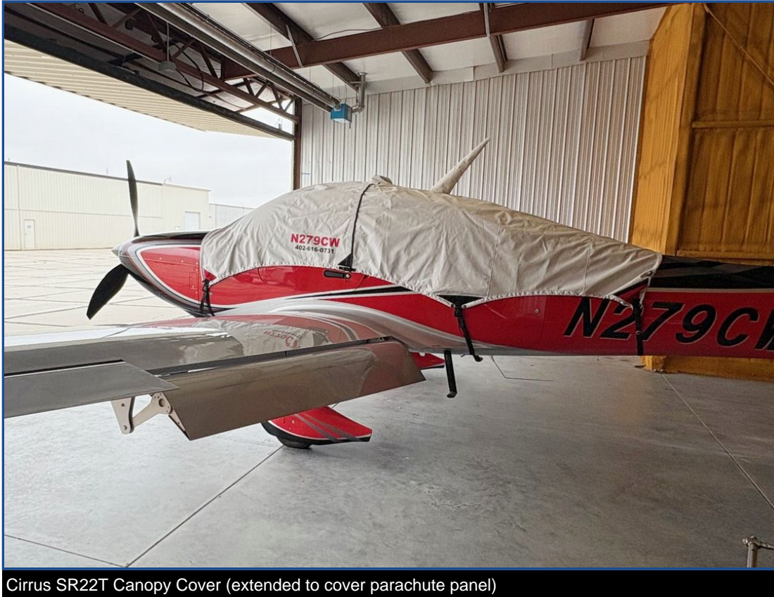
Cirrus SR22T Canopy Cover (extended to cover parachute panel)