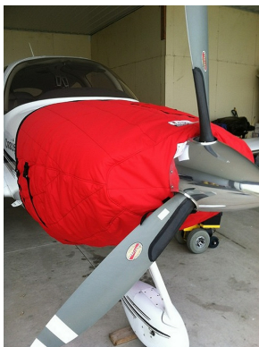
Cirrus SR22 Insulated Engine Cover

This cover type is made from Silver Acrylic Sunbrella canvas and is 100% lined with a soft and smooth microfiber. Bruce's Custom Covers developed this material combination especially for aircraft protection. The outer material is medium weight and treated for water resistance, UV resistance and anti-static buildup. The inner lining is a very soft and smooth microfiber to prevent scratching. The material is very reflective, and tests show that the cabin interior temperature can be reduced to near-ambient temperature on the hottest of days. It is water, ice and snow repellent, yet breathable to allow moisture to escape from between the cover and the aircraft surface.