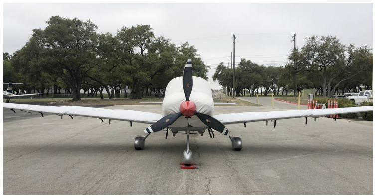
Cirrus SR-22 Canopy/Engine & Wing Covers