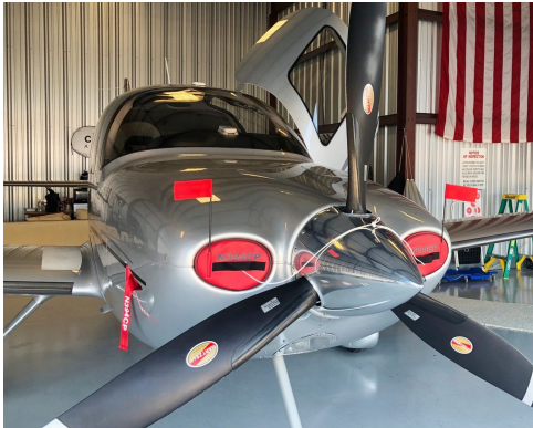
Cirrus SR-22 Engine Plugs

Engine Inlet Plugs are custom fit for your Cirrus SR22 intakes, made with heavy-duty vinyl material, and stuffed with a single block of sculpted urethane foam. Each plug has a zipper that allows the foam to be removed and dried if necessary. Engine plugs have warning flags that are visible from the cockpit or 'remove before flight' streamers sewn onto the face of the plugs. Most plugs are imprinted with the aircraft registration number in black for an extra charge. Storage bag NOT included. Engine plugs may be inserted after flight when the engine is still warm. Engine Inlet Plugs are commonly referred to as Cowl Plugs, Intake Plugs, Cowl Blocks, Engine Blocks, and Engine Bungs.