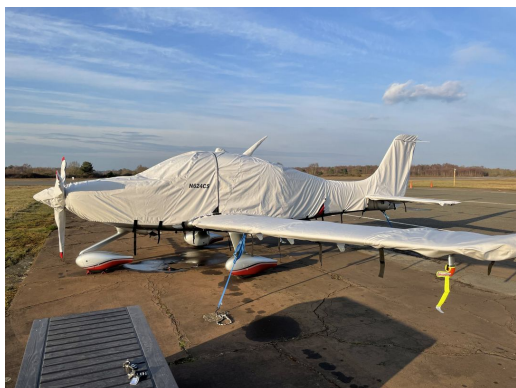
Cirrus SR-22 Complete Cover Set

WINTER USE MATERIAL - Made with Solution-Dyed Polyester fabric, this option is intended for seasonal use to aid in deicing, rain mitigation, or for occasional travel. The material is lighter and more compact, but more susceptible to UV damage and may have a shorter useful life if used continuously outside than the all-year use material.