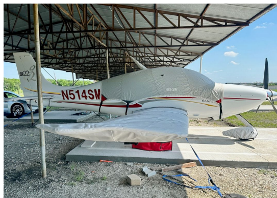
Cirrus SR-22 Canopy, Wing & Wheelpan Covers