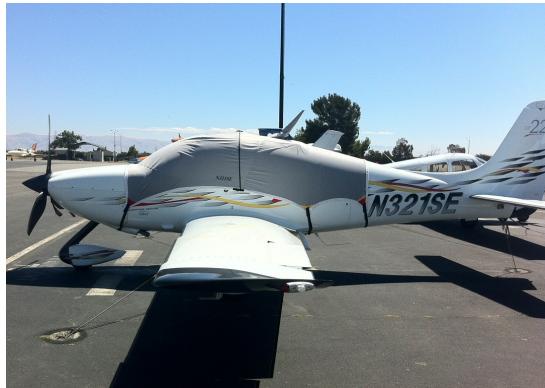
Cirrus SR-22 Light Weight Travel Cover

non-travel Sunbrella Cover is the best choice.