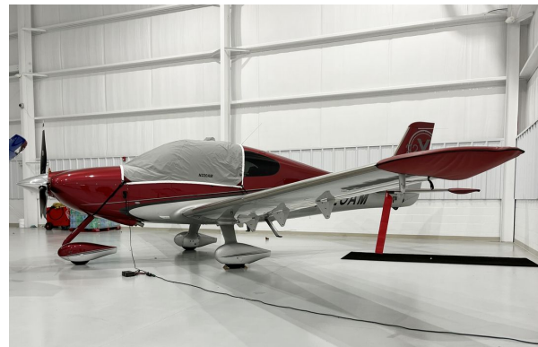
Cirrus SR-22 Cockpit Cover