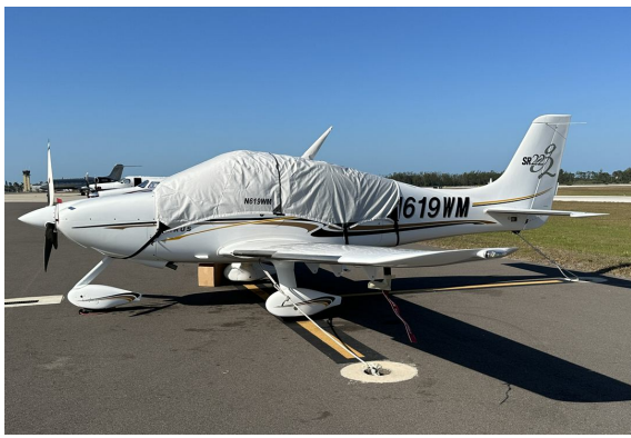
Cirrus SR22 Canopy Cover