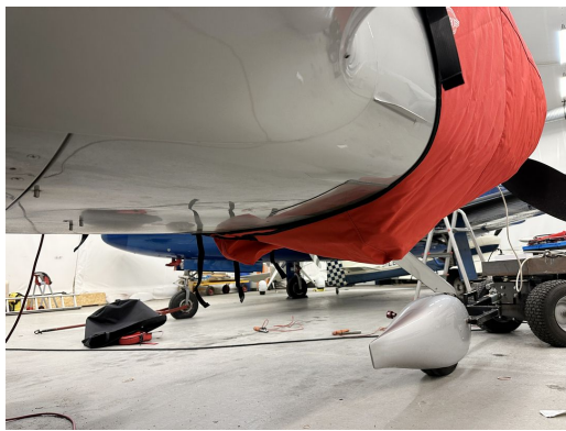
Cirrus SR-22 Insulated Engine Cover