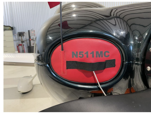
Cirrus SR22T Engine Inlet Plugs