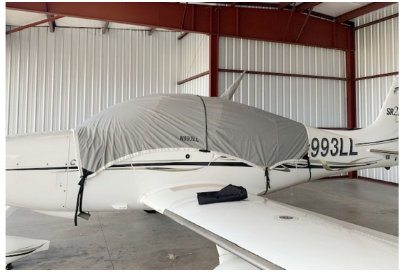
Cirrus SR-22 Travel Weight Canopy Cover