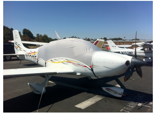
Cirrus Light Weight Travel Canopy Cover