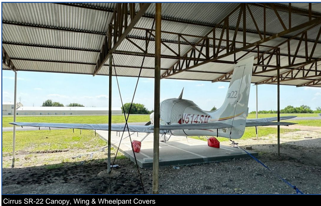
Cirrus SR-22 Canopy, Wing &amp; Wheelpant Covers