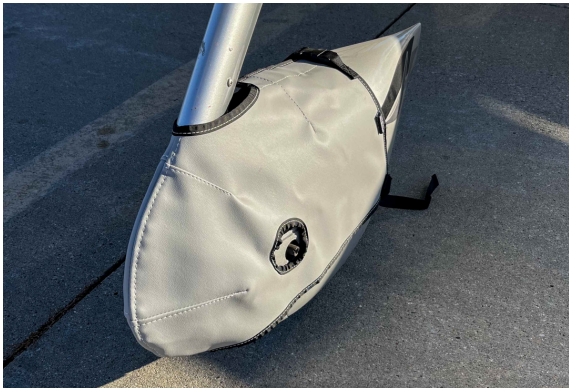
Cirrus SR22 Abbreviated Front Wheelpant (For Tow Bar Protection)