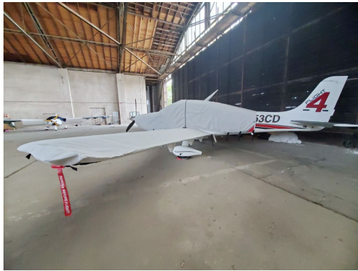
Cirrus SR20 Wing Covers, All Year Use (set of 2)

WINTER USE MATERIAL - Made with Solution-Dyed Polyester fabric, this option is intended for seasonal use to aid in deicing, rain mitigation, or for occasional travel. The material is lighter and more compact, but more susceptible to UV damage and may have a shorter useful life if used continuously outside than the all-year use material.