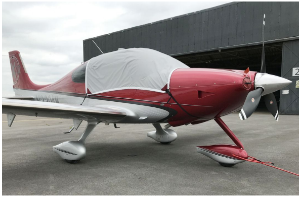
Cirrus SR-22 Cockpit Cover