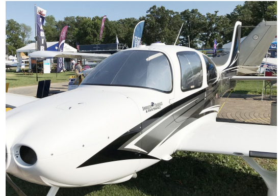
Cirrus SR-22 Cockpit HeatShields