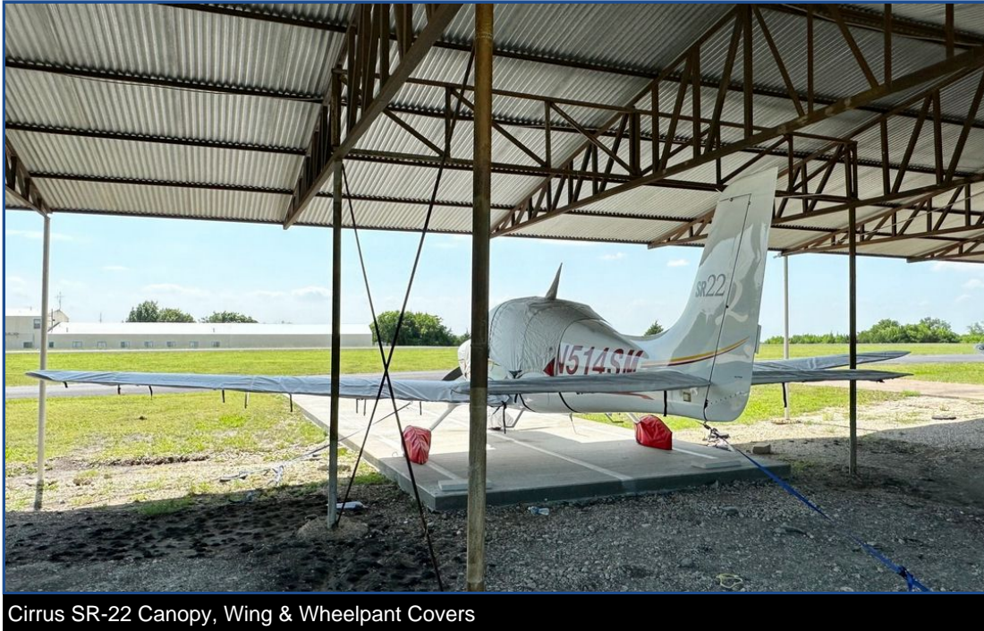
Cirrus SR-22 Canopy, Wing &amp; Wheelpant Covers