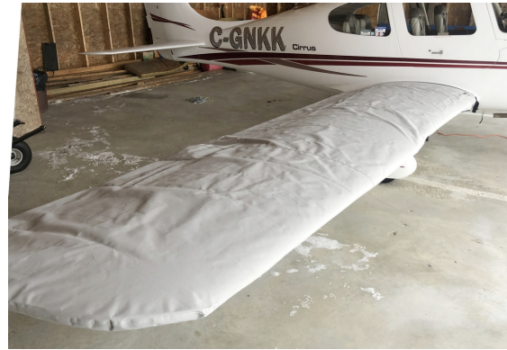
Cirrus SR20 Wing Covers Winter Use with Imprint