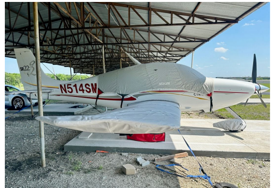
Cirrus SR-22 Canopy, Wing & Wheelpant Covers