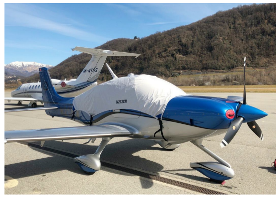
Cirrus SR-22 Canopy Cover (extends to cover parachute panel), Engine Plugs