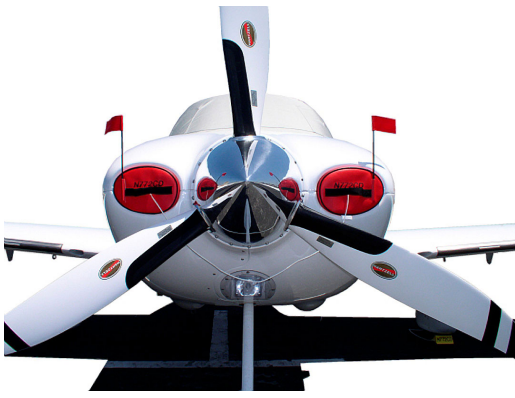
Cirrus SR22 Engine Plugs