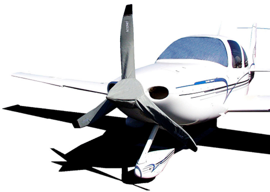
Cirrus SR-22 Propellor/Spinner Cover & Windshield Heatshield

Windshield Heatshields are interior sunshades for an aircraft's front windshield. The product is a unique composite of closed-cell foam with a silver mylar finish. The semi-rigid design is stiff enough to stand along the inside of the windshield using sun visors or window framing. It folds up flat and easily stores in the included storage sleeve. Some designs may require velcro and suction cups or split right and left sides. A Heatshield is an excellent short-term remedy for cockpit overheating. An external fabric cover is far more effective and practical for long-term protection.