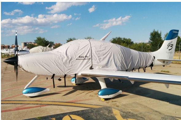
Cirrus SR22 Extended Canopy/Engine Cover, Extends To Horiz. Stab. Leading Edge