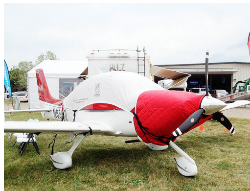
Cirrus SR22 Canopy Cover / Insulated Engine Cover / Wing Covers