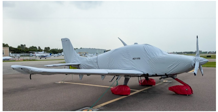
Cirrus SR-20 Complete Cover Set