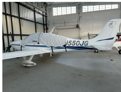
Cirrus SR20 Canopy Cover (Does Not Cover Parachute Panel)