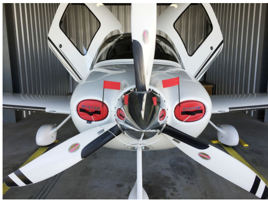
Cirrus SR22 Engine Inlet Plugs