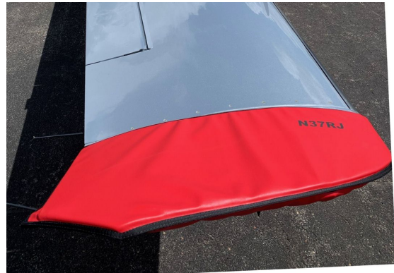
Cirrus SR-22 Wingtip Pads