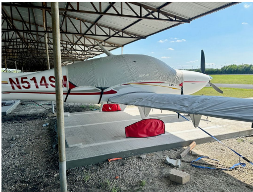
Cirrus SR-22 Canopy, Wing & Wheelpant Covers

WINTER USE MATERIAL - Made with Solution-Dyed Polyester fabric, this option is intended for seasonal use to aid in deicing, rain mitigation, or for occasional travel. The material is lighter and more compact, but more susceptible to UV damage and may have a shorter useful life if used continuously outside than the all-year use material.