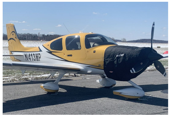
Cirrus SR22T Insulated Engine Cover