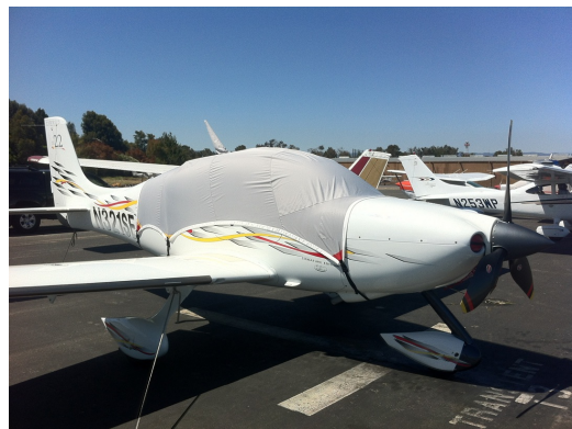
Cirrus SR-22 Light Weight Travel Cover

This cover type is made from Silver Acrylic Sunbrella canvas and is 100% lined with a soft and smooth microfiber. Bruce's Custom Covers developed this material combination especially for aircraft protection. The outer material is medium weight and treated for water resistance, UV resistance and anti-static buildup. The inner lining is a very soft and smooth microfiber to prevent scratching. The material is very reflective, and tests show that the cabin interior temperature can be reduced to near-ambient temperature on the hottest of days. It is water, ice and snow repellent, yet breathable to allow moisture to escape from between the cover and the aircraft surface.