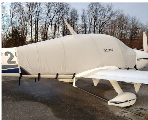
Cirrus SR-22 Extended Canopy Cover

This cover type is made from Silver Acrylic Sunbrella canvas and is 100% lined with a soft and smooth microfiber. Bruce's Custom Covers developed this material combination especially for aircraft protection. The outer material is medium weight and treated for water resistance, UV resistance and anti-static buildup. The inner lining is a very soft and smooth microfiber to prevent scratching. The material is very reflective, and tests show that the cabin interior temperature can be reduced to near-ambient temperature on the hottest of days. It is water, ice and snow repellent, yet breathable to allow moisture to escape from between the cover and the aircraft surface.