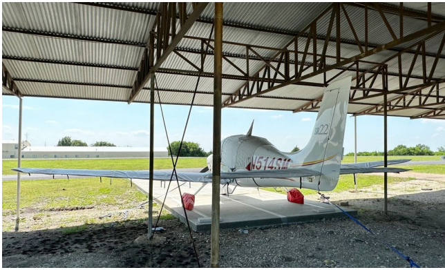
Cirrus SR-22 Canopy, Wing & Wheelpant Covers