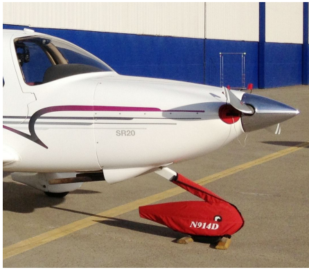
Cirrus SR20 Front Wheelpant/Strut Cover, Engine Plugs