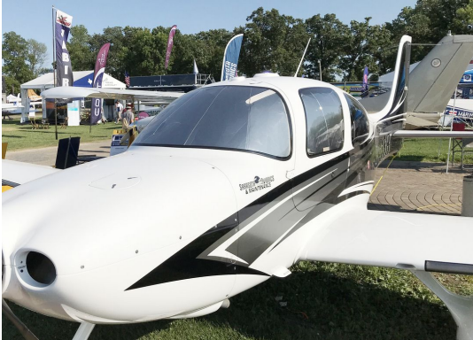
Cirrus SR-22 Cockpit HeatShields