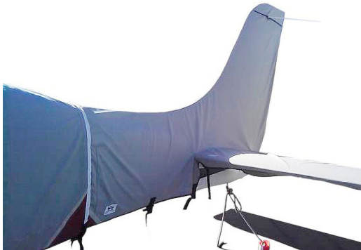
Cirrus SR20 Empennage Cover (covers tail boom, vertical and horizontal stabilizers)