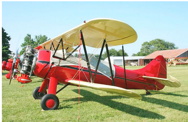
Waco YMF Canopy Cover

The Spezio Tuholer Canopy/Engine Cover is a one-piece cover (100% lined with microfiber) that is a combination of the Canopy Cover and Engine Cover. This cover will enclose the engine cowl and will extend aft to cover all of the windows. This cover type is made from Silver Acrylic Sunbrella canvas and is 100% lined with a soft and smooth microfiber. Bruce's Custom Covers developed this material combination especially for aircraft protection. The outer material is medium weight and treated for water resistance, UV resistance and anti-static buildup. The inner lining is a very soft and smooth microfiber to prevent scratching. The material is very reflective, and tests show that the cabin interior temperature can be reduced to near-ambient temperature on the hottest of days. It is water, ice and snow repellent, yet breathable to allow moisture to escape from between the cover and the aircraft surface.