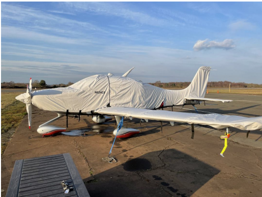
Cirrus SR-22 Complete Cover Set