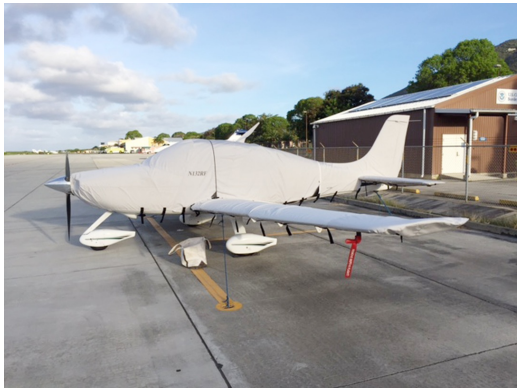
Cirrus SR-22 Full Cover Set

WINTER USE MATERIAL - Made with Solution-Dyed Polyester fabric, this option is intended for seasonal use to aid in deicing, rain mitigation, or for occasional travel. The material is lighter and more compact, but more susceptible to UV damage and may have a shorter useful life if used continuously outside than the all-year use material.