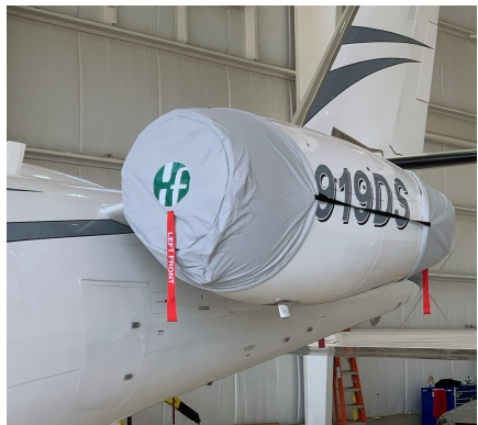
ASTRA SPX Engine Covers with TR's

The Israel Aircraft Industries Astra SPX Bikini Style Engine Covers are a single-piece design using a soft and smooth stretchy fabric. The cover stretches tightly over both the intake and exhaust, installing quickly and easily. These covers are designed to be used as hangar dust covers and have a useful life of approximately one year.