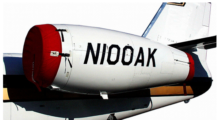
Engine Cover Set for the Astra