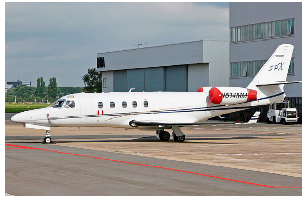
IAI-1125A Astra SPX Engine Cover set