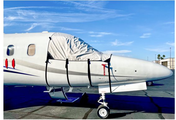
IAI Astra SPX Cockpit Cover