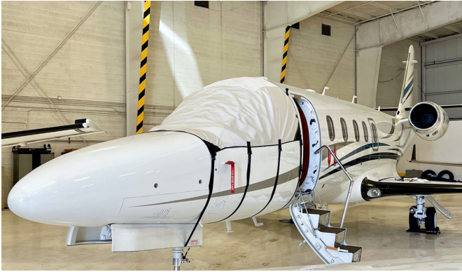
Astra SPX Cockpit Cover

This cover type is made from Silver Acrylic Sunbrella canvas and is 100% lined with a soft and smooth microfiber. Bruce's Custom Covers developed this material combination especially for aircraft protection. The outer material is medium weight and treated for water resistance, UV resistance and anti-static buildup. The inner lining is a very soft and smooth microfiber to prevent scratching. The material is very reflective, and tests show that the cabin interior temperature can be reduced to near-ambient temperature on the hottest of days. It is water, ice and snow repellent, yet breathable to allow moisture to escape from between the cover and the aircraft surface.