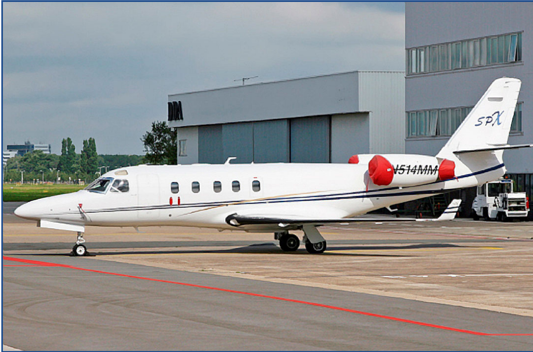
IAI-1125A Astra SPX Engine Cover set