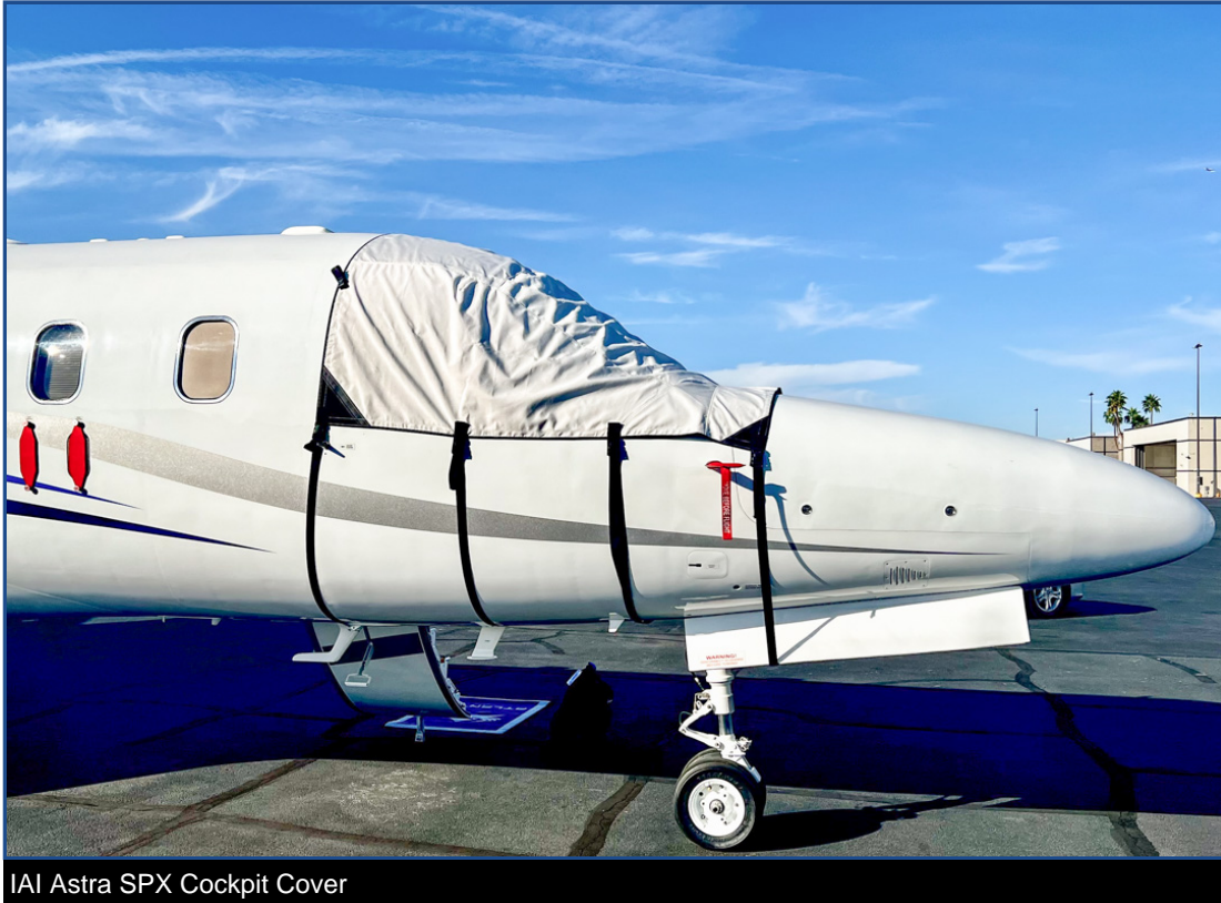
IAI Astra SPX Cockpit Cover