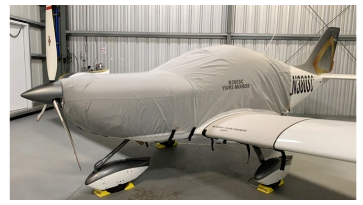
Czech Sport Canopy/Engine & Wing Covers