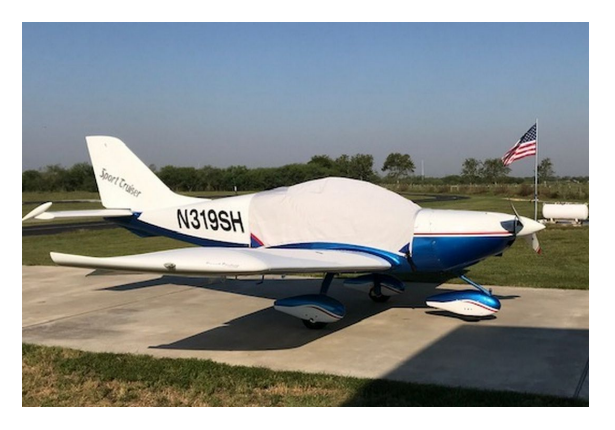
SportCruiser Canopy Cover

This cover type is made from Silver Acrylic Sunbrella canvas and is 100% lined with a soft and smooth microfiber. Bruce's Custom Covers developed this material combination especially for aircraft protection. The outer material is medium weight and treated for water resistance, UV resistance and anti-static buildup. The inner lining is a very soft and smooth microfiber to prevent scratching. The material is very reflective, and tests show that the cabin interior temperature can be reduced to near-ambient temperature on the hottest of days. It is water, ice and snow repellent, yet breathable to allow moisture to escape from between the cover and the aircraft surface.