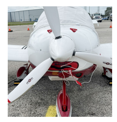
SportCruiser Engine Inlet Plugs

Engine Inlet Plugs are custom fit for your Czech Aircraft Works SportCruiser intakes, made with heavy-duty vinyl material, and stuffed with a single block of sculpted urethane foam. Each plug has a zipper that allows the foam to be removed and dried if necessary. Engine plugs have warning flags that are visible from the cockpit or 'remove before flight' streamers sewn onto the face of the plugs. Most plugs are imprinted with the aircraft registration number in black for an extra charge. Storage bag NOT included. Engine plugs may be inserted after flight when the engine is still warm. Engine Inlet Plugs are commonly referred to as Cowl Plugs, Intake Plugs, Cowl Blocks, Engine Blocks, and Engine Bungs.