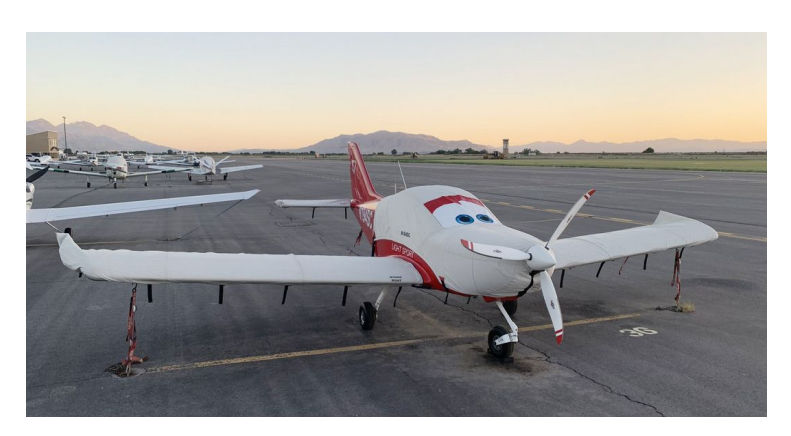
SportCruiser Canopy/Engine & Wing Covers