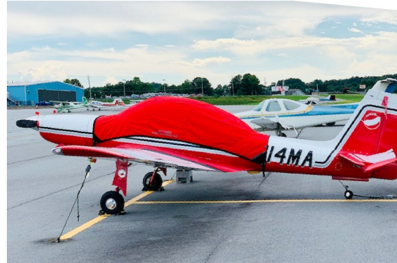
Micco SP20 Canopy Cover