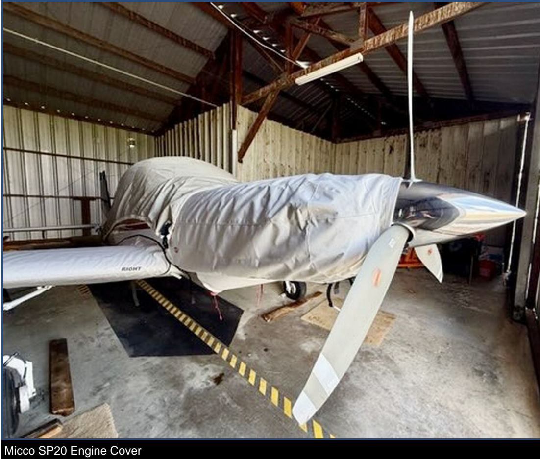
Micco SP20 Engine Cover