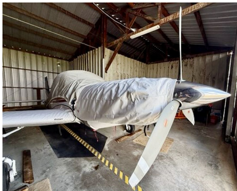
Micco SP20 Engine Cover

This cover type is made from Silver Acrylic Sunbrella canvas and is 100% lined with a soft and smooth microfiber. Bruce's Custom Covers developed this material combination especially for aircraft protection. The outer material is medium weight and treated for water resistance, UV resistance and anti-static buildup. The inner lining is a very soft and smooth microfiber to prevent scratching. The material is very reflective, and tests show that the cabin interior temperature can be reduced to near-ambient temperature on the hottest of days. It is water, ice and snow repellent, yet breathable to allow moisture to escape from between the cover and the aircraft surface.