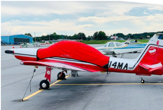
Micco SP20 Canopy Cover

The Micco SP20 Canopy/Engine Cover is a one-piece cover (100% lined with microfiber) that is a combination of the Canopy Cover and Engine Cover. This cover will enclose the engine cowl and will extend aft to cover all of the windows. This cover type is made from Silver Acrylic Sunbrella canvas and is 100% lined with a soft and smooth microfiber. Bruce's Custom Covers developed this material combination especially for aircraft protection. The outer material is medium weight and treated for water resistance, UV resistance and anti-static buildup. The inner lining is a very soft and smooth microfiber to prevent scratching. The material is very reflective, and tests show that the cabin interior temperature can be reduced to near-ambient temperature on the hottest of days. It is water, ice and snow repellent, yet breathable to allow moisture to escape from between the cover and the aircraft surface.