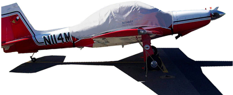
Micco SP20 Canopy Cover & Engine Inlet Plugs