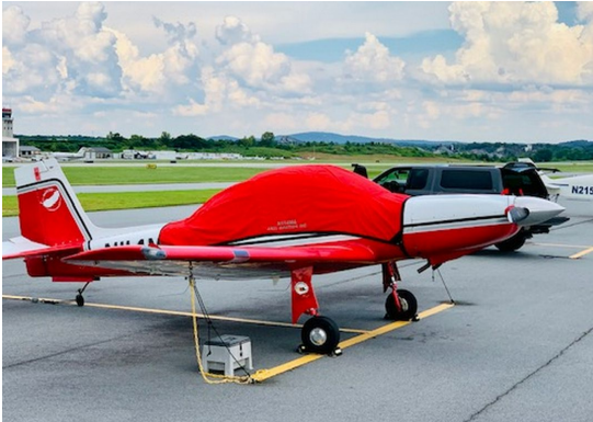
Micco SP20 Canopy Cover

The Micco SP20 Canopy/Engine Cover is a one-piece cover (100% lined with microfiber) that is a combination of the Canopy Cover and Engine Cover. This cover will enclose the engine cowl and will extend aft to cover all of the windows. This cover type is made from Silver Acrylic Sunbrella canvas and is 100% lined with a soft and smooth microfiber. Bruce's Custom Covers developed this material combination especially for aircraft protection. The outer material is medium weight and treated for water resistance, UV resistance and anti-static buildup. The inner lining is a very soft and smooth microfiber to prevent scratching. The material is very reflective, and tests show that the cabin interior temperature can be reduced to near-ambient temperature on the hottest of days. It is water, ice and snow repellent, yet breathable to allow moisture to escape from between the cover and the aircraft surface.