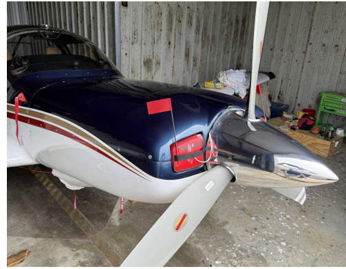
Micco SP-20 Engine Plugs