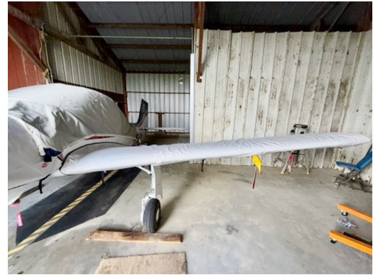
Micco SP20 Wing Covers, All Year Use