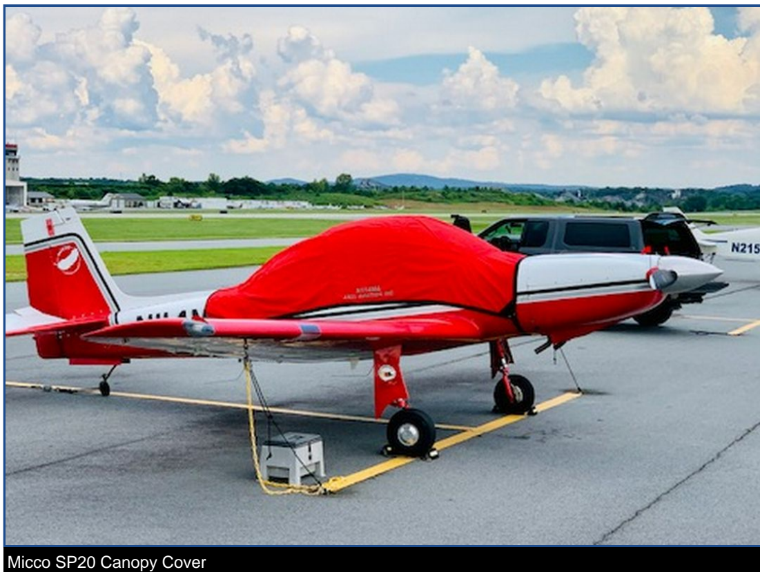
Micco SP20 Canopy Cover