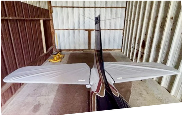
Micco SP20 Horizontal Stabilizer Covers

WINTER USE MATERIAL - Made with Solution-Dyed Polyester fabric, this option is intended for seasonal use to aid in deicing, rain mitigation, or for occasional travel. The material is lighter and more compact, but more susceptible to UV damage and may have a shorter useful life if used continuously outside than the all-year use material.