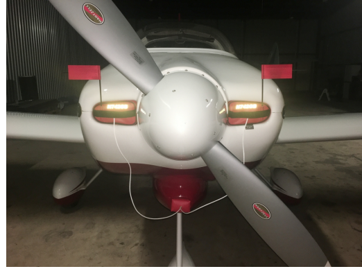
Van's Aircraft RV-7A Engine Inlet Plugs