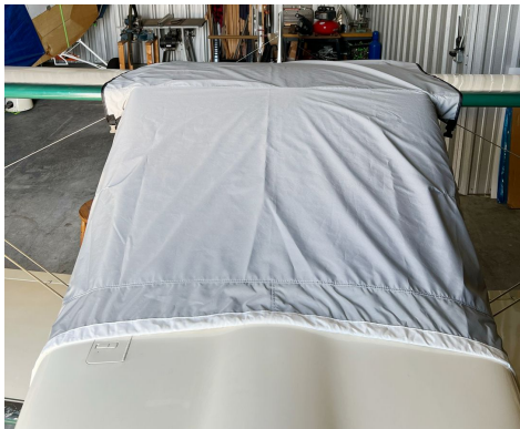
Sorrell SNS-7 Hiperbipe Over The Top Travel Canopy Cover

Travel Covers are made with Silver Solution-Dyed Polyester fabric and only lined over the windshield to save weight. The material is lightweight and more compact for easy stowage in the aircraft. The polyester material is water resistant, but only intended for occasional use outside. We also have an ultra lightweight material available for fitted hangar dust covers. For daily outdoor use, the non-travel Sunbrella Cover is the best choice.