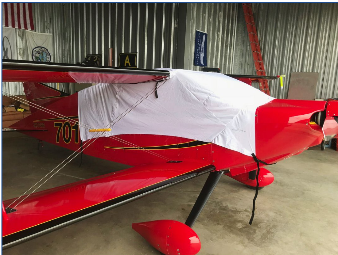
Sorrell Hiperbiplane Canopy Cover (test fit cover)