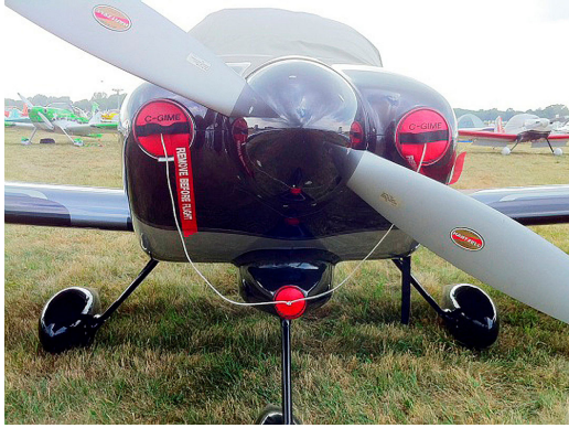
Van's RV-7 Engine Inlet Plugs

Engine Inlet Plugs are custom fit for your Sorrell Hiperbipe SNS-7 intakes, made with heavy-duty vinyl material, and stuffed with a single block of sculpted urethane foam. Each plug has a zipper that allows the foam to be removed and dried if necessary. Engine plugs have warning flags that are visible from the cockpit or 'remove before flight' streamers sewn onto the face of the plugs. Most plugs are imprinted with the aircraft registration number in black for an extra charge. Storage bag NOT included. Engine plugs may be inserted after flight when the engine is still warm. Engine Inlet Plugs are commonly referred to as Cowl Plugs, Intake Plugs, Cowl Blocks, Engine Blocks, and Engine Bungs.