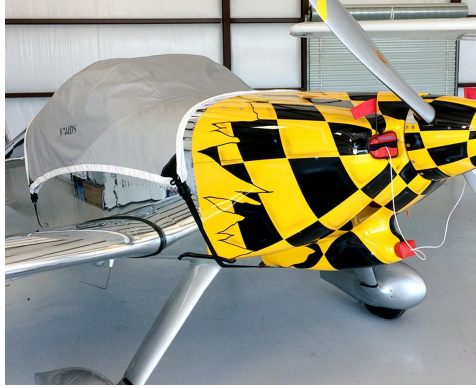
Van's RV-7 Engine Inlet Plugs

Engine Inlet Plugs are custom fit for your Sorrell Hiperbipe SNS-7 intakes, made with heavy-duty vinyl material, and stuffed with a single block of sculpted urethane foam. Each plug has a zipper that allows the foam to be removed and dried if necessary. Engine plugs have warning flags that are visible from the cockpit or 'remove before flight' streamers sewn onto the face of the plugs. Most plugs are imprinted with the aircraft registration number in black for an extra charge. Storage bag NOT included. Engine plugs may be inserted after flight when the engine is still warm. Engine Inlet Plugs are commonly referred to as Cowl Plugs, Intake Plugs, Cowl Blocks, Engine Blocks, and Engine Bungs.