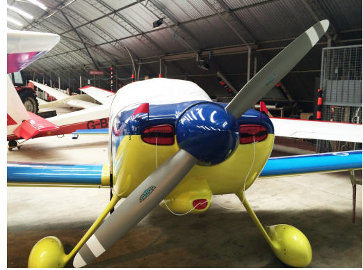
Van's RV-6 Engine Inlet Plugs