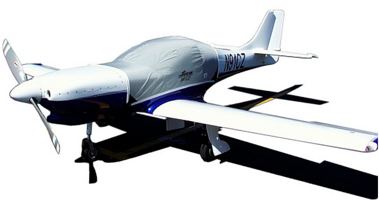
Canopy Cover for Lancair 320/360