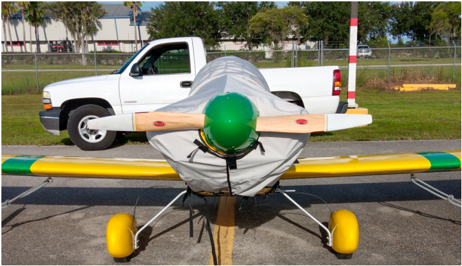
Sonerai Racer Engine Cover

The material is very reflective, and tests show that the cabin interior temperature can be reduced to near-ambient temperature on the hottest of days. It is water, ice and snow repellent, yet breathable to allow moisture to escape from between the cover and the aircraft surface.