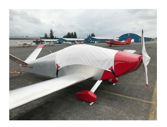
Sonex Xenos Canopy & Prop Cover