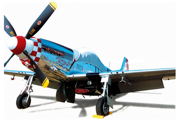
Canopy Cover, Belly & Chin Scoop Plugs