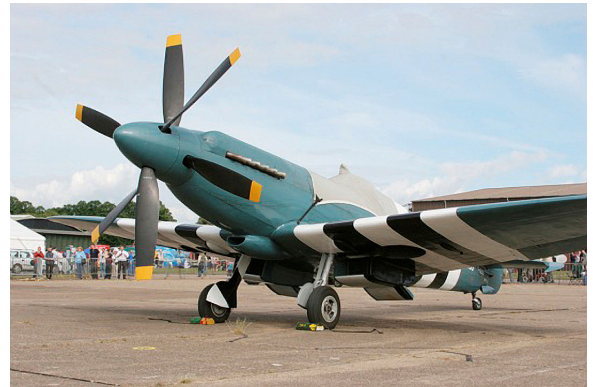
Supermarine Spitfire XIX Canopy Cover