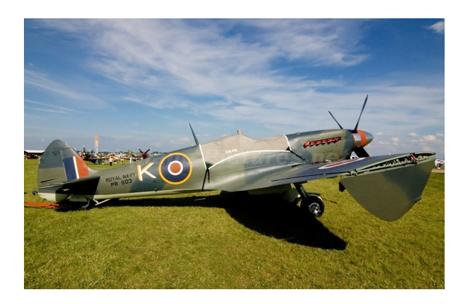
Supermarine Spitfire Mk IX Canopy Cover