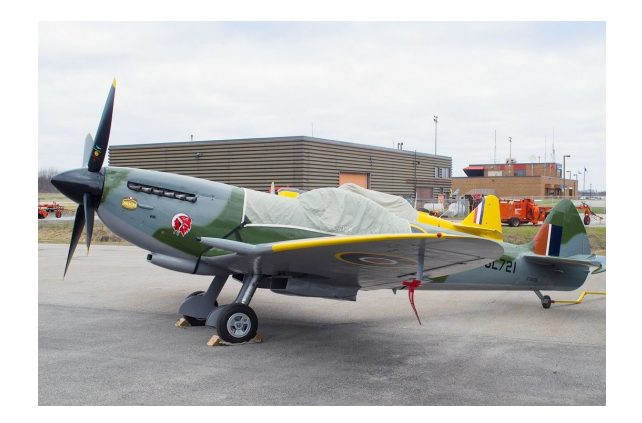
Supermarine Spitfire Mk 14 Canopy Cover