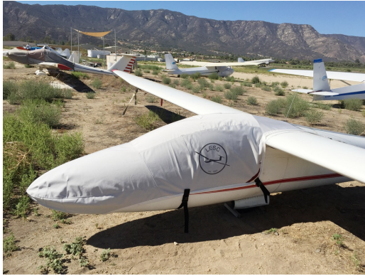
Pilatus B4 Canopy/Nose Cover