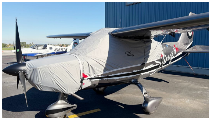
Sling High Wing Canopy Cover & Engine Cover