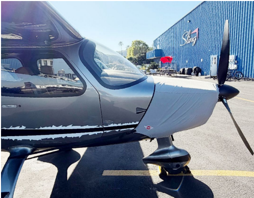
Sling High Wing Engine Cover

This cover type is made from Silver Acrylic Sunbrella canvas and is 100% lined with a soft and smooth microfiber. Bruce's Custom Covers developed this material combination especially for aircraft protection. The outer material is medium weight and treated for water resistance, UV resistance and anti-static buildup. The inner lining is a very soft and smooth microfiber to prevent scratching. The material is very reflective, and tests show that the cabin interior temperature can be reduced to near-ambient temperature on the hottest of days. It is water, ice and snow repellent, yet breathable to allow moisture to escape from between the cover and the aircraft surface.