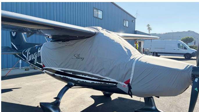
Sling High Wing Canopy Cover & Engine Cover

Travel Covers are made with Silver Solution-Dyed Polyester fabric and only lined over the windshield to save weight. The material is lightweight and more compact for easy stowage in the aircraft. The polyester material is water resistant, but only intended for occasional use outside. We also have an ultra lightweight material available for fitted hangar dust covers. For daily outdoor use, the non-travel Sunbrella Cover is the best choice.