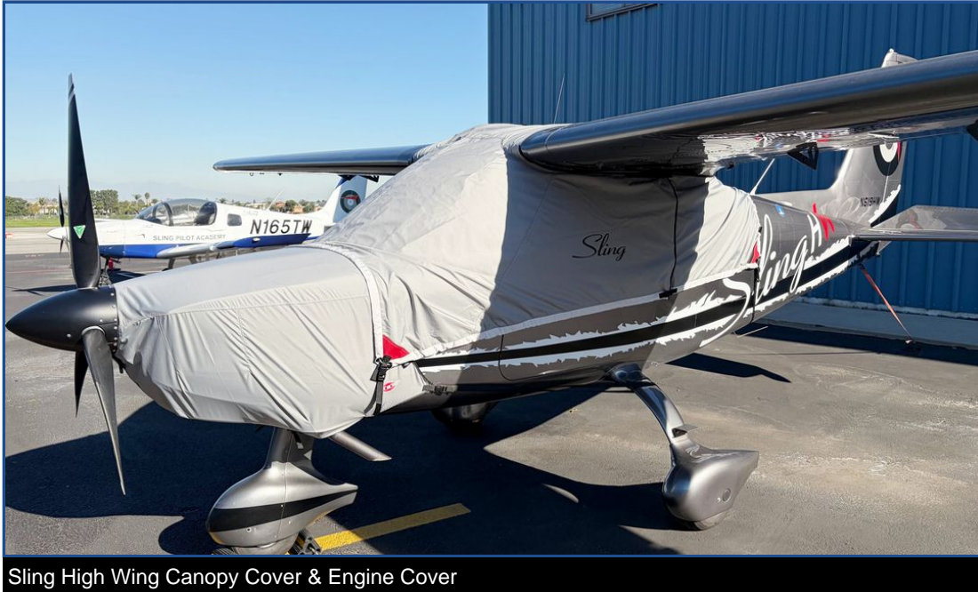
Sling High Wing Canopy Cover &amp; Engine Cover