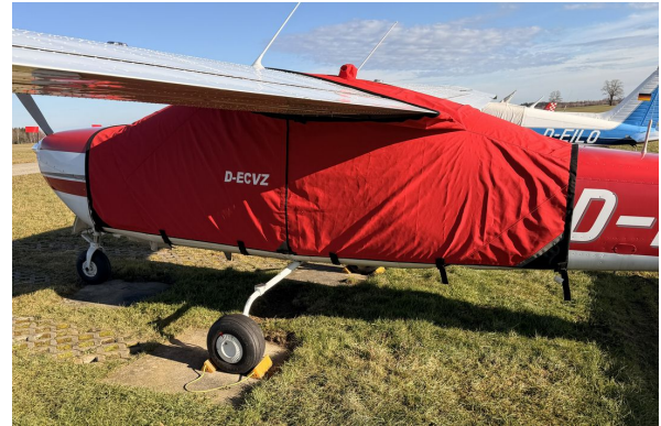
Cessna 177 Cardinal Extended Canopy Cover, Over Top Type Cessna 177 Cardinal Extended Canopy Cover, Over Top Type