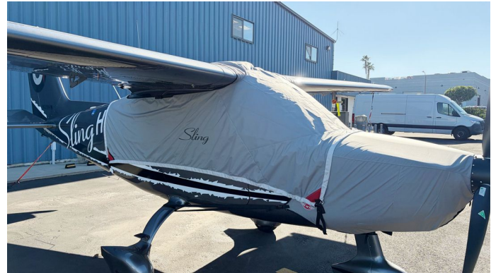
Sling High Wing Canopy Cover & Engine Cover