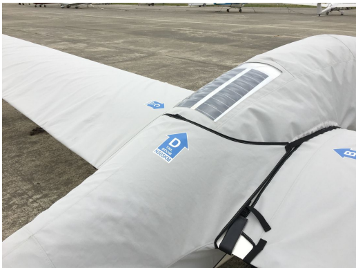
DG-505 Full Cover Set

WINTER USE MATERIAL - Made with Solution-Dyed Polyester fabric, this option is intended for seasonal use to aid in deicing, rain mitigation, or for occasional travel. The material is lighter and more compact, but more susceptible to UV damage and may have a shorter useful life if used continuously outside than the all-year use material.