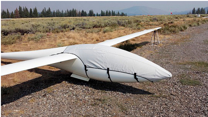
ASW-20C Canopy/Nose Cover