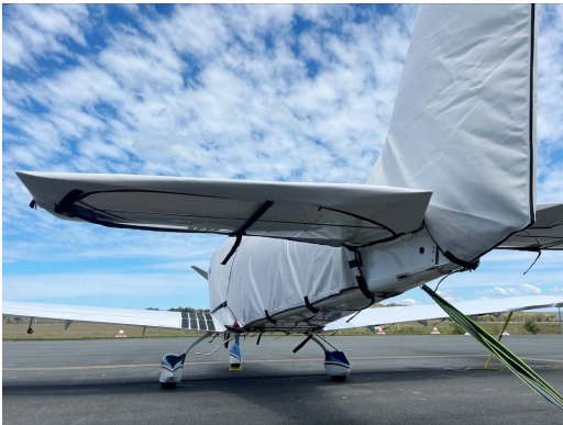
Sling 4 TSi Empennage Cover