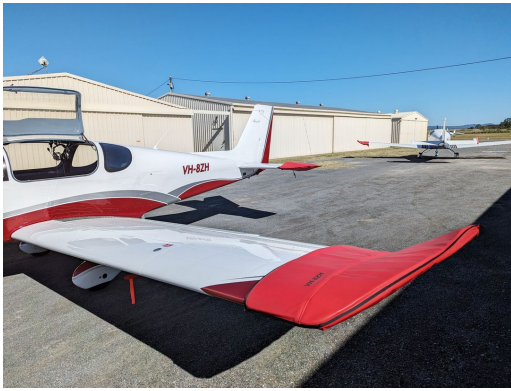
Sling TSI Wing & Horizontal Stabilizer Tip Pads