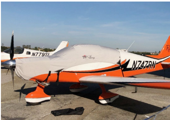
Airplane Factory Sling 4 Canopy/Engine Cover