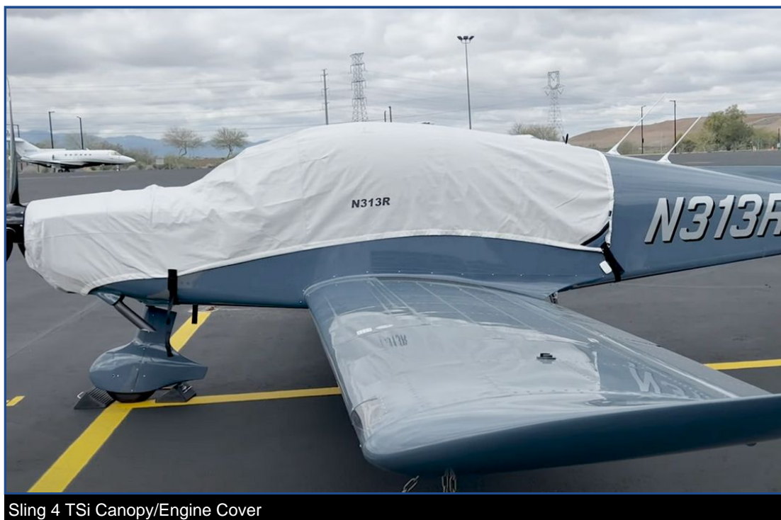
Sling 4 TSi Canopy/Engine Cover