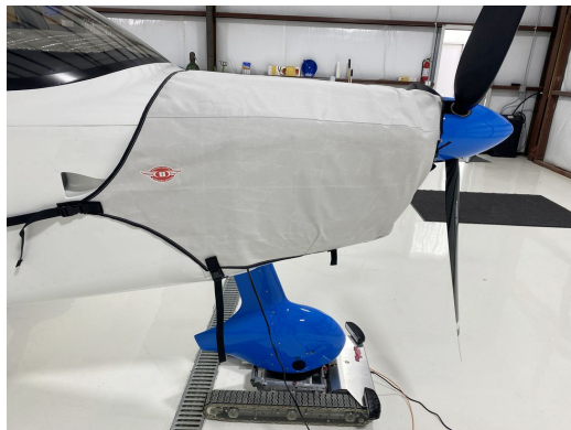
Sling TSI Engine Cover

This cover type is made from Silver Acrylic Sunbrella canvas and is 100% lined with a soft and smooth microfiber. Bruce's Custom Covers developed this material combination especially for aircraft protection. The outer material is medium weight and treated for water resistance, UV resistance and anti-static buildup. The inner lining is a very soft and smooth microfiber to prevent scratching. The material is very reflective, and tests show that the cabin interior temperature can be reduced to near-ambient temperature on the hottest of days. It is water, ice and snow repellent, yet breathable to allow moisture to escape from between the cover and the aircraft surface.