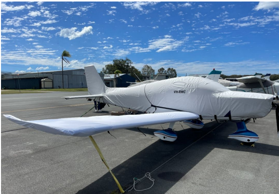
Sling 4 TSi Complete Cover Set

WINTER USE MATERIAL - Made with Solution-Dyed Polyester fabric, this option is intended for seasonal use to aid in deicing, rain mitigation, or for occasional travel. The material is lighter and more compact, but more susceptible to UV damage and may have a shorter useful life if used continuously outside than the all-year use material.