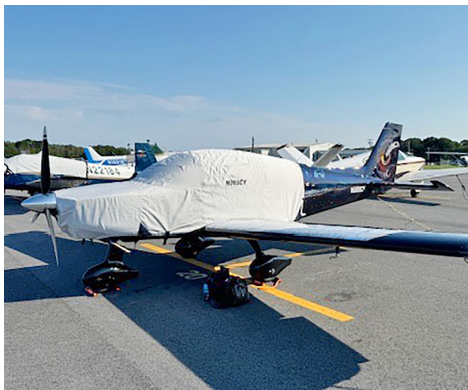
Sling TSI Extended Canopy/Engine Cover

This cover type is made from Silver Acrylic Sunbrella canvas and is 100% lined with a soft and smooth microfiber. Bruce's Custom Covers developed this material combination especially for aircraft protection. The outer material is medium weight and treated for water resistance, UV resistance and anti-static buildup. The inner lining is a very soft and smooth microfiber to prevent scratching. The material is very reflective, and tests show that the cabin interior temperature can be reduced to near-ambient temperature on the hottest of days. It is water, ice and snow repellent, yet breathable to allow moisture to escape from between the cover and the aircraft surface.