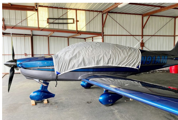
Sling 4 TSI Light Weight Travel Cover