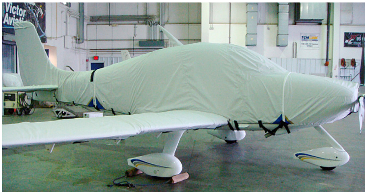
Cirrus SR20 Full Cover Set (Extended Canopy Cover, Engine Cover, Wing Covers, Empennage Cover)