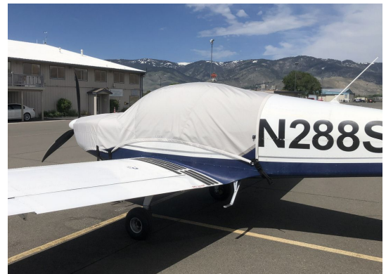
Sling 2 Canopy/Engine Cover