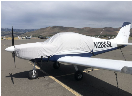
Sling 2 Canopy/Engine Cover

This cover type is made from Silver Acrylic Sunbrella canvas and is 100% lined with a soft and smooth microfiber. Bruce's Custom Covers developed this material combination especially for aircraft protection. The outer material is medium weight and treated for water resistance, UV resistance and anti-static buildup. The inner lining is a very soft and smooth microfiber to prevent scratching. The material is very reflective, and tests show that the cabin interior temperature can be reduced to near-ambient temperature on the hottest of days. It is water, ice and snow repellent, yet breathable to allow moisture to escape from between the cover and the aircraft surface.