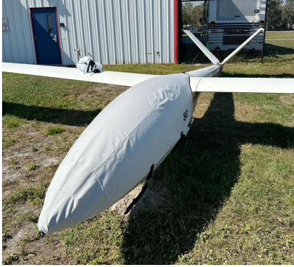
Schreder HP-18 Canopy/Nose Cover

The material is very reflective, and tests show that the cabin interior temperature can be reduced to near-ambient temperature on the hottest of days. It is water, ice and snow repellent, yet breathable to allow moisture to escape from between the cover and the aircraft surface.