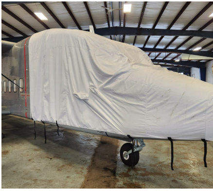
Short Skyvan Forward Fuselage/Nose Cover