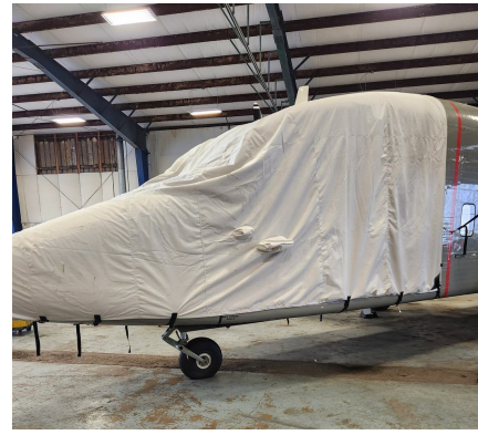
Short Skyvan Forward Fuselage/Nose Cover