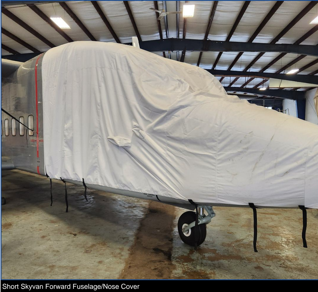
Short Skyvan Forward Fuselage/Nose Cover