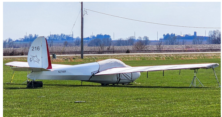
Schweizer 1-26 Canopy/Nose Cover, Wing Covers