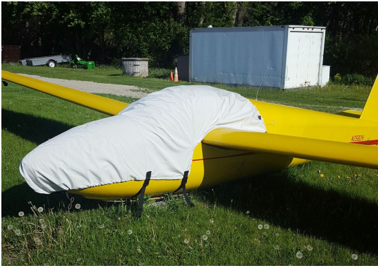
Schweizer SGS 1-26E Canopy/Nose Cover

the hottest of days. It is water, ice and snow repellent, yet breathable to allow moisture to escape from between the cover and the aircraft surface.