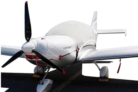
Sportcruiser Canopy Cover & Plugs

Engine Inlet Plugs are custom fit for your Tomark Aero Viper SD4 intakes, made with heavy-duty vinyl material, and stuffed with a single block of sculpted urethane foam. Each plug has a zipper that allows the foam to be removed and dried if necessary. Engine plugs have warning flags that are visible from the cockpit or 'remove before flight' streamers sewn onto the face of the plugs. Most plugs are imprinted with the aircraft registration number in black for an extra charge. Storage bag NOT included. Engine plugs may be inserted after flight when the engine is still warm. Engine Inlet Plugs are commonly referred to as Cowl Plugs, Intake Plugs, Cowl Blocks, Engine Blocks, and Engine Bungs.