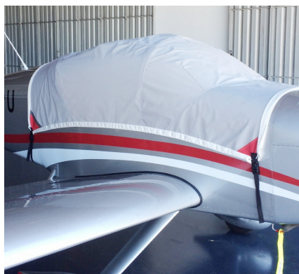
Vans's RV-9 Light Weight Travel Canopy Cover

This cover type is made from Silver Acrylic Sunbrella canvas and is 100% lined with a soft and smooth microfiber. Bruce's Custom Covers developed this material combination especially for aircraft protection. The outer material is medium weight and treated for water resistance, UV resistance and anti-static buildup. The inner lining is a very soft and smooth microfiber to prevent scratching. The material is very reflective, and tests show that the cabin interior temperature can be reduced to near-ambient temperature on the hottest of days. It is water, ice and snow repellent, yet breathable to allow moisture to escape from between the cover and the aircraft surface.