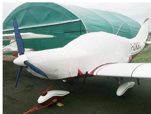
PiperSport Canopy/Engine Cover, Wing Locker Covers