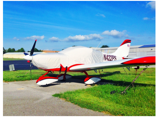
SportCruiser Canopy/Engine Cover