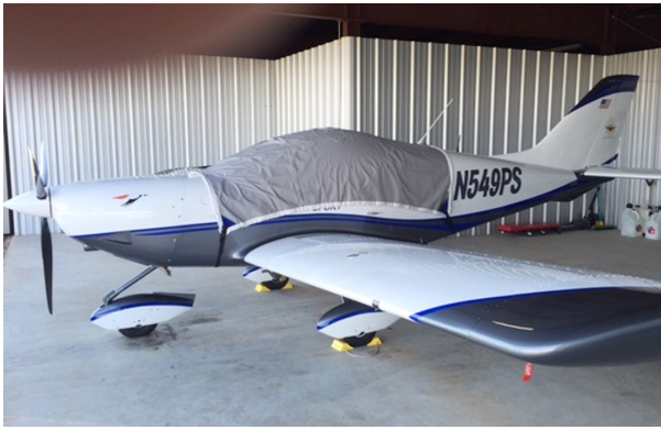
PiperSport Light Weight Travel Cover