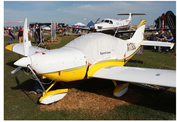
PiperSport Canopy Cover, Engine Plugs