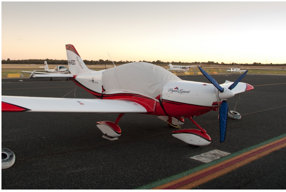
PiperSport Canopy Cover, Engine Plugs