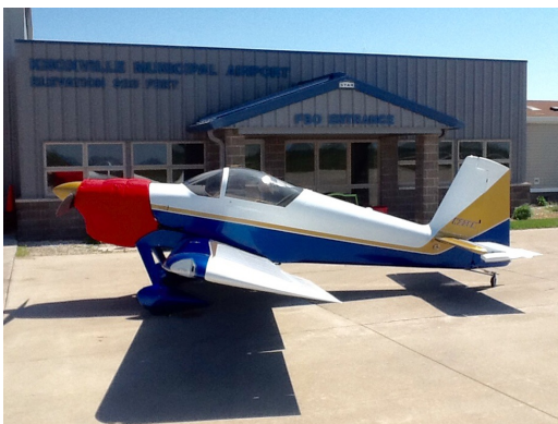
Van's RV-7 Insulated Engine Cover

This cover type is made from Silver Acrylic Sunbrella canvas and is 100% lined with a soft and smooth microfiber. Bruce's Custom Covers developed this material combination especially for aircraft protection. The outer material is medium weight and treated for water resistance, UV resistance and anti-static buildup. The inner lining is a very soft and smooth microfiber to prevent scratching. The material is very reflective, and tests show that the cabin interior temperature can be reduced to near-ambient temperature on the hottest of days. It is water, ice and snow repellent, yet breathable to allow moisture to escape from between the cover and the aircraft surface.